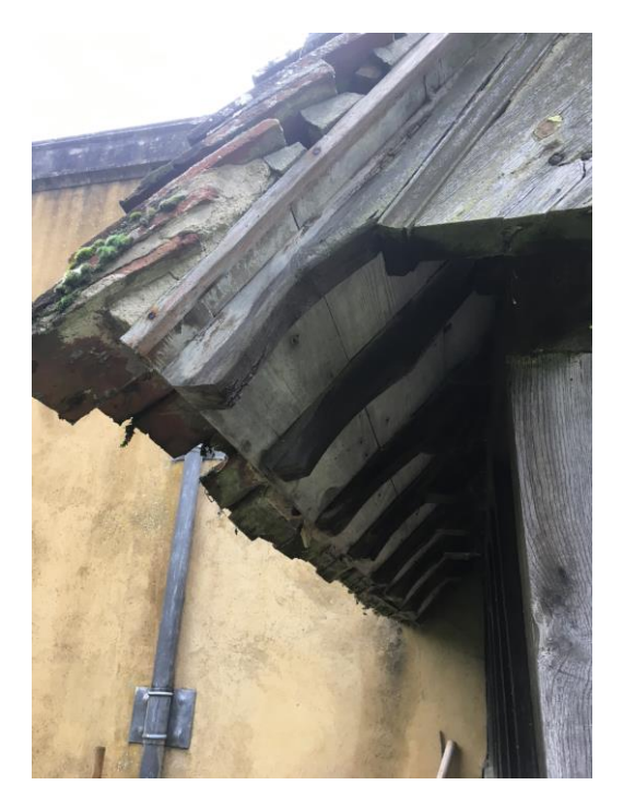
North porch entrance, details pre-repair.