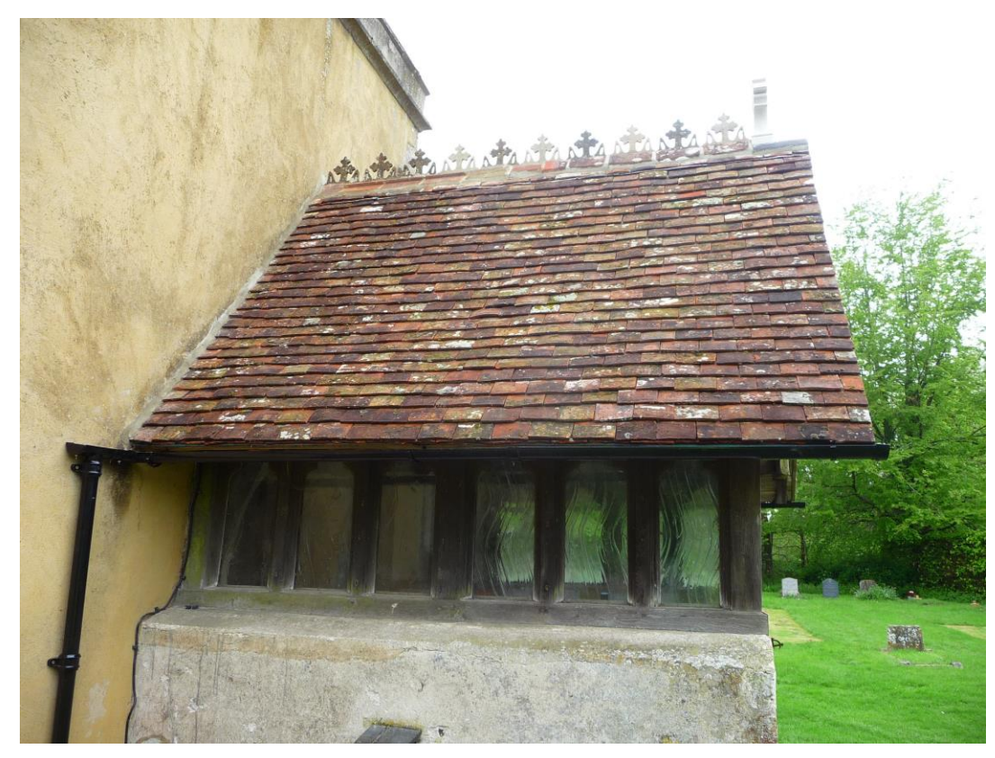
North porch entrance, post-repair.