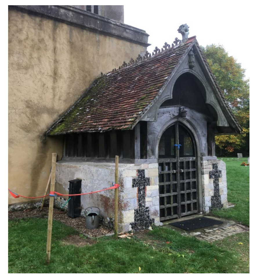
North porch entrance, pre-repair.