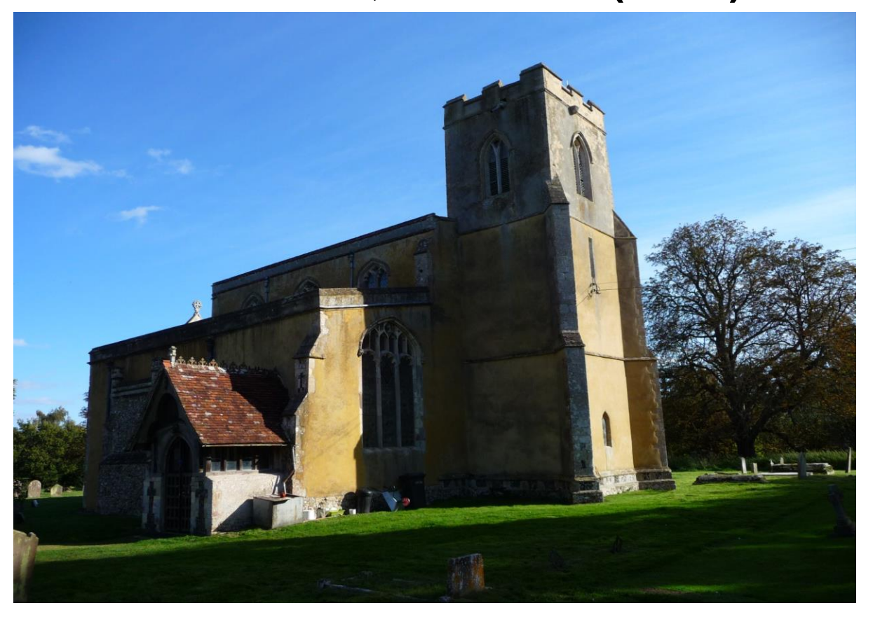
Grade I, ca. 14th Century