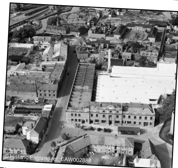
The Sexton, Son and Everard Ltd Shoe Manufactory (St Mary's Works), Norwich, 1946.

How do you think the resident of 75 Earlham Road was linked to this building?