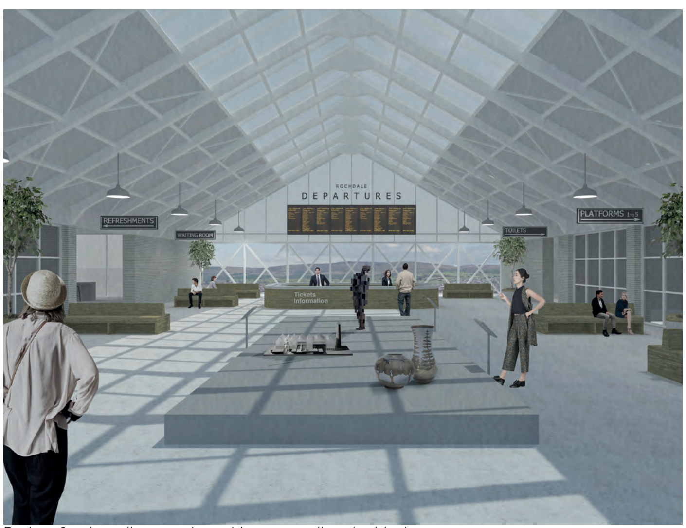
Project for the railway station with an art gallery by Hugh.