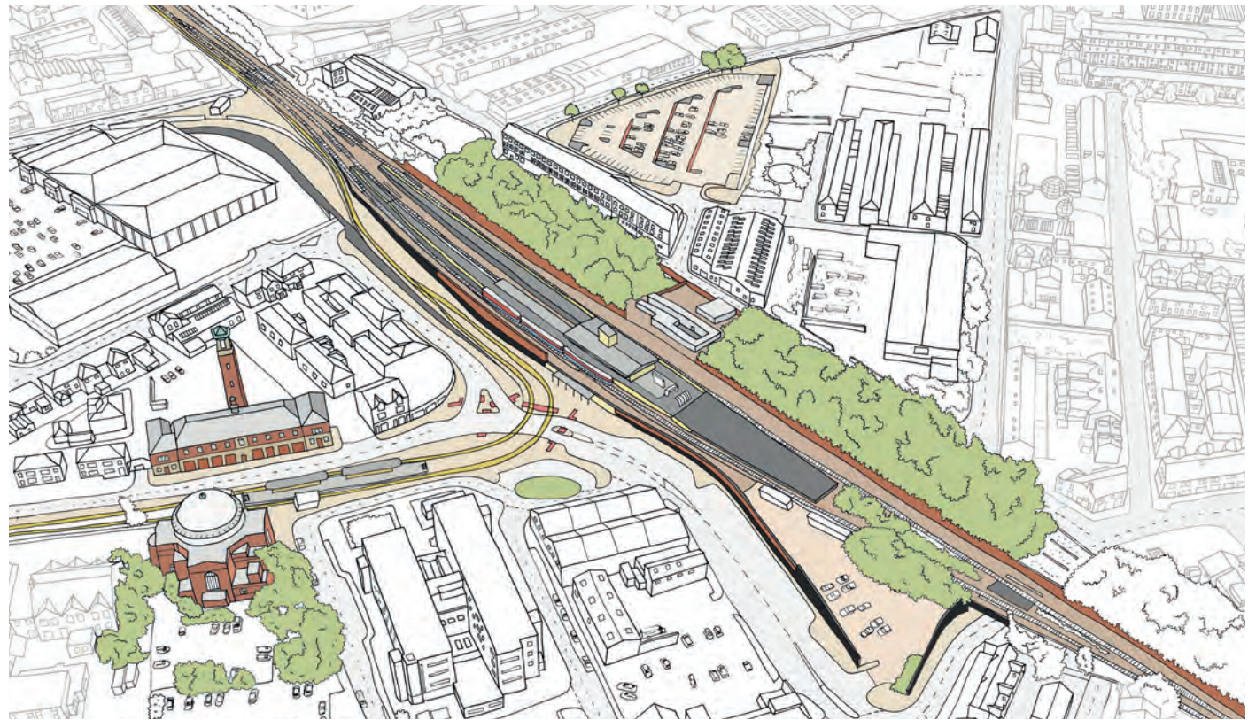
This drawing is a birds eye view which shows the station and its surroundings from the sky.

The challenge of this site is to give the station a new design and improve the public areas around it. This new area should link the station and the Fire Station museum and consider how to improve pedestrian and cycling connections to the town centre.