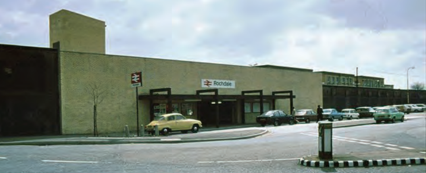
The Railway Station in 1913 (top) and 1970 (bottom).