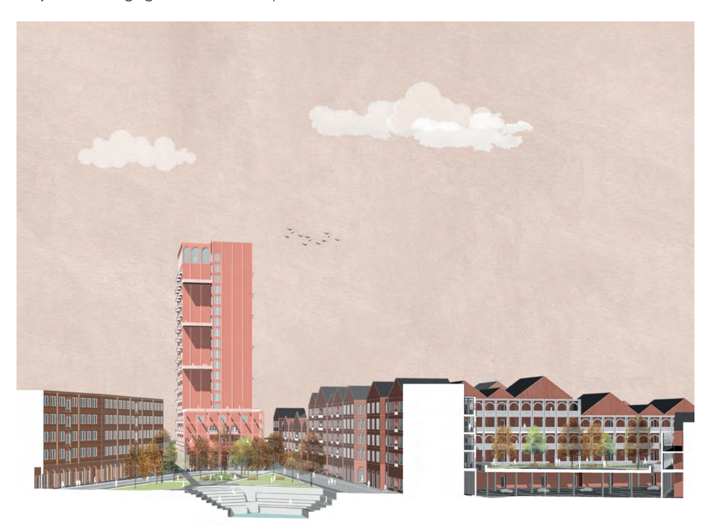
Project for a tall tower block, houses and green space by Suyeb and Hidayatullah.