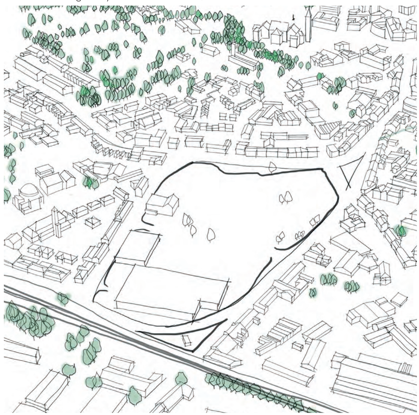
This drawing is a birds eye view which shows the retail park and its surroundings from the sky.

The site has potential for new homes and could be a high quality urban neighbourhood at a key gateway location into the town which addresses the links to Rochdale's historic high street and one of the main gateways to the town centre, Drake Street.