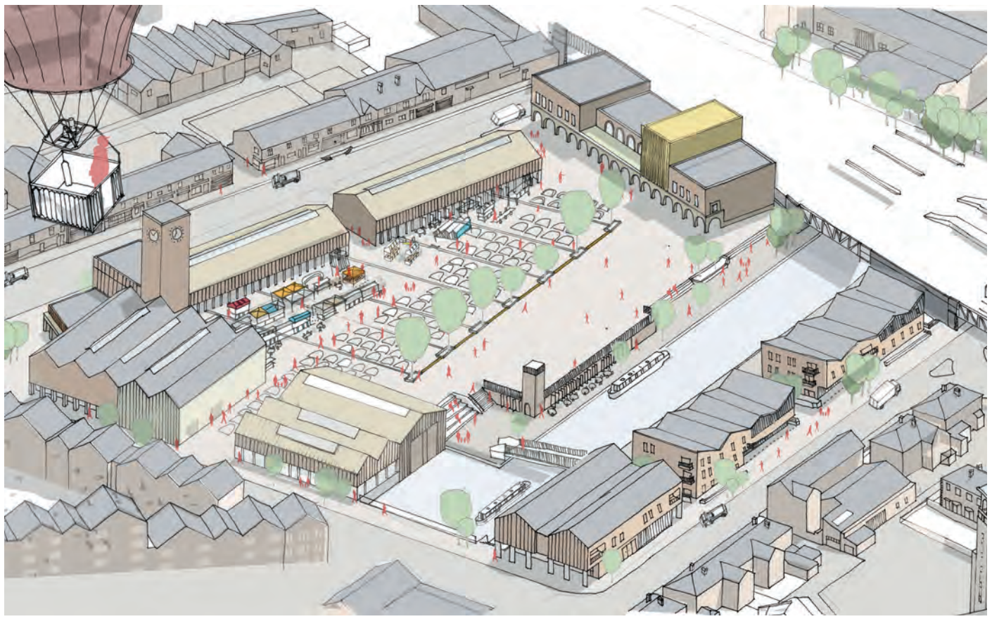
Project for bringing back the canal by Subhan.