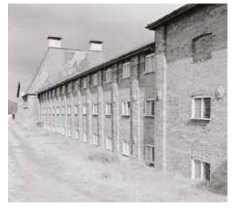
Hythe Maltings, Colchester, Essex Ref: AA98_05281