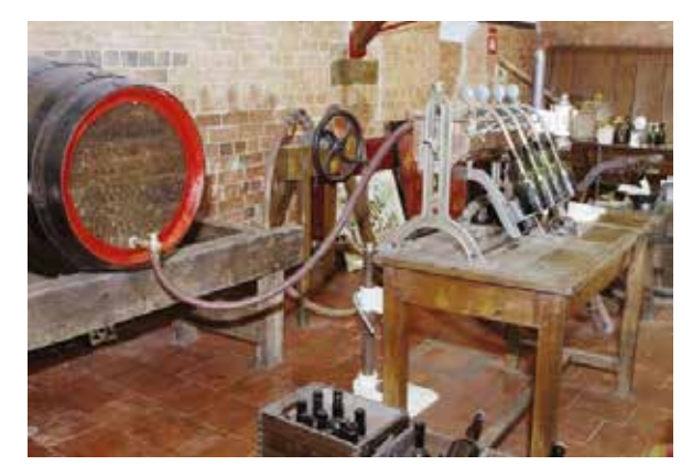
Beer bottling equipment at Hook Norton Brewery Museum, Oxfordshire © Historic England Ref: aa030946