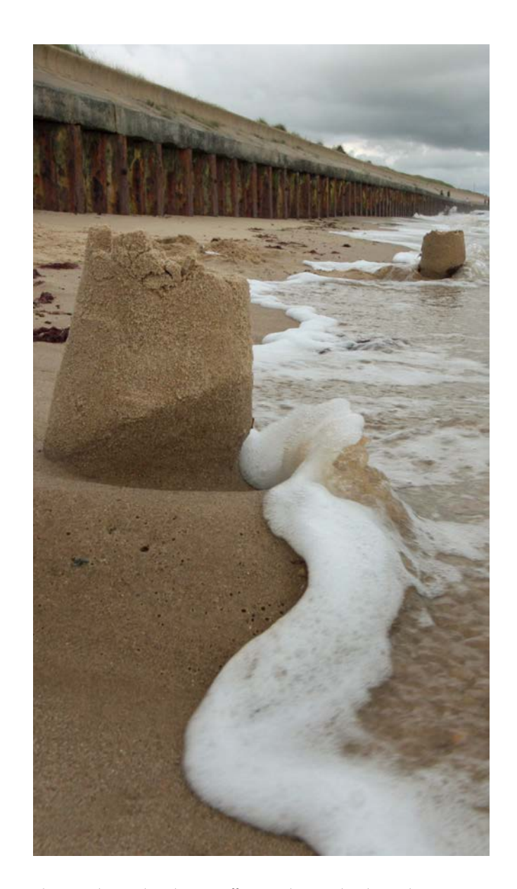
Above: Policy and Evidence staff are working to develop a climate change strategy for Historic England and the historic environment.

Our Public Engagement group inspires and enables our audiences to understand, enjoy and look after the historic environment – to encourage public support for Historic England. The Content, Marketing and Digital teams shape Historic England's brand, producing content and campaigns which reach right across all channels, including digital and social. The Public Relations and Programmes area includes a media and public affairs team (including regional public engagement managers), and roles linked with strategic events and cultural programmes. The Learning, Volunteering and Inclusion team supports the strategic development of a diverse workforce and programme, building new partnerships across the historic environment sector, and inspires the next generation through the Heritage Schools programme.