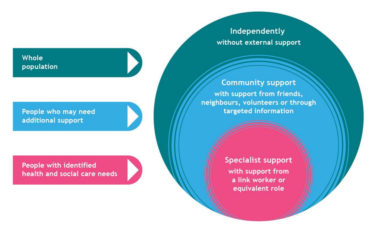
Figure 1.1: Social Prescribing Ecosystem