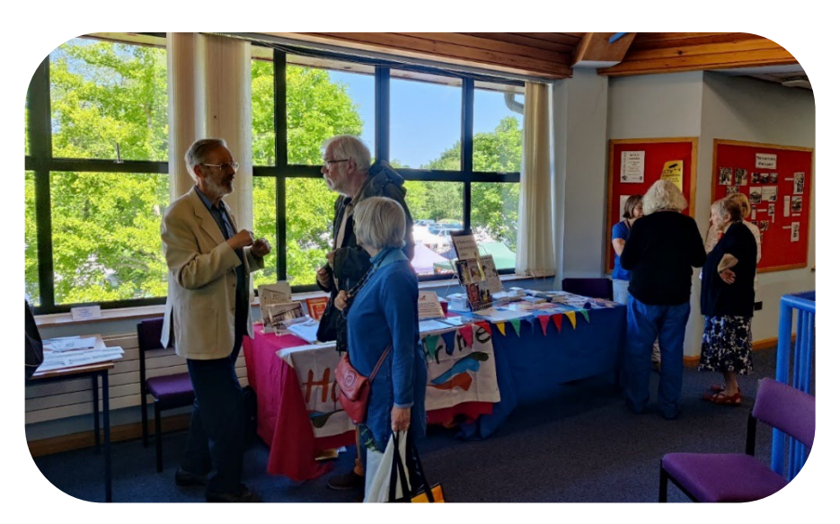
Stalls at Frome Local History Day

aspect of ensuring the delivery is engaging and accessible to all. More could have been done to promote these sessions and align them with meaningful, facilitated engagement for those who may face barriers to participating in heritage activities.