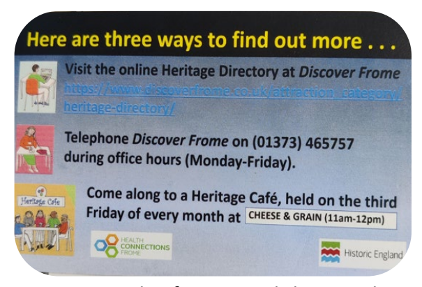
An example of a postcard showing the three access points