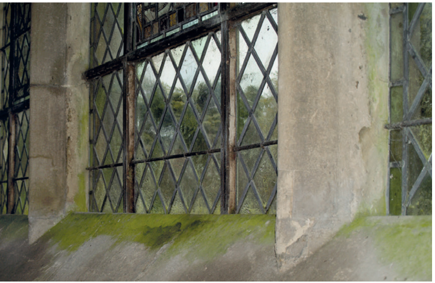
All the familiar water-driven deterioration (salt cycling, timber decay, corrosion) requires liquid water; even where water vapour is involved, the problems arise when it condenses.