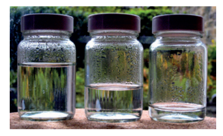
The air inside all three sealed bottles is saturated (as shown by the condensation) and this is independent of the water level. There are more than a 'vigintillion' (10²°) water molecules in a single drop of water, so the reservoir needed to reach saturation is tiny.

Water vapour is often the principal topic raised by building physicists, but when it comes to understanding deterioration, liquid water is of infinitely greater importance. It is affected by gravity, so water from a leaking gutter will quickly find a path through the pores of the materials and flow down to collect at the base of the wall; this is a common cause of so-called 'rising damp'. In pores, however, gravity is only one of the possible forces driving movement.