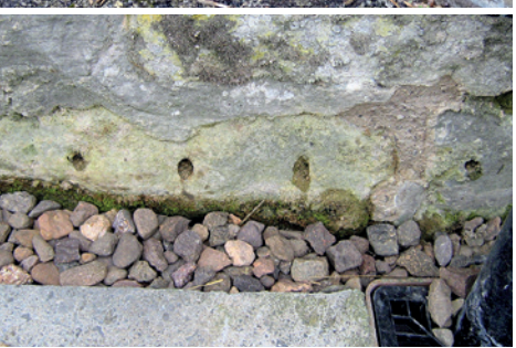
Failed remedial treatments are often based on wrong notions about the behaviour of water. The operation of Knapen tubes, for example, is based on the idea that humid air is heavy and so will fall. In reality, humid air rises.

HE CRITICAL links between water and almost every form of building deterioration do not need repeating here, nor does the fact that porous materials interact closely with moisture. On the other hand – as the various claims for miracle remedial products make clear – the mechanisms by which water moves into and through building materials are not so well understood.