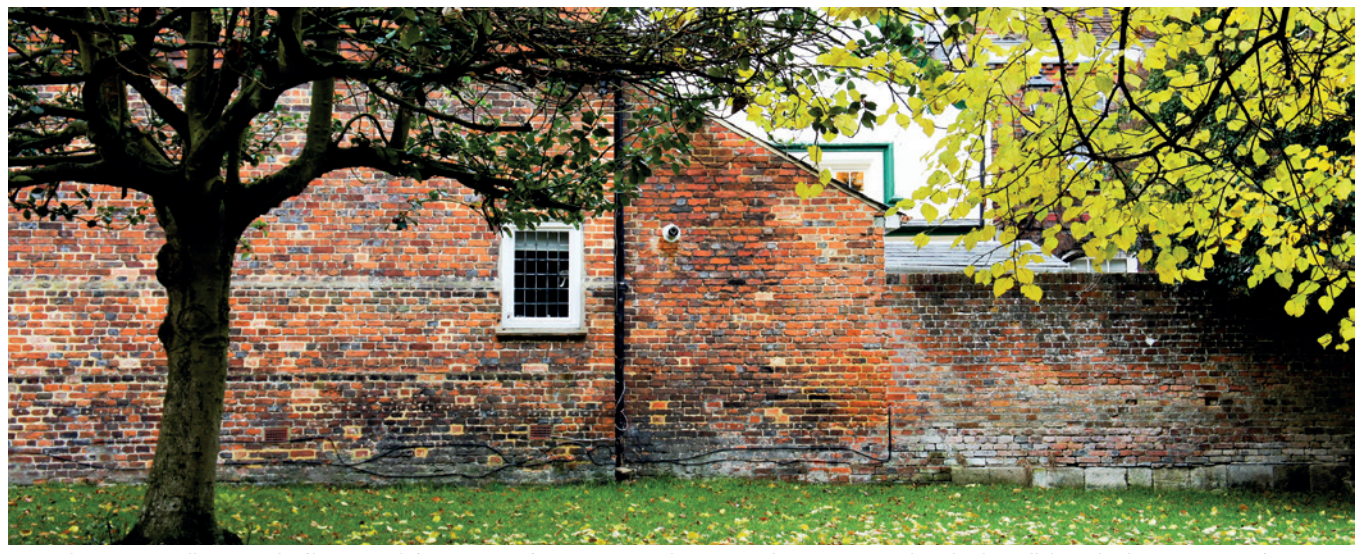
Rising damp' is an excellent example of how many different sources of moisture can produce very similar symptoms. At the right, this wall shows the classic symptoms often attributed to capillary rise from groundwater: a zone of salt damage and staining, separating a dry area above from a wet area below. Closer examination shows that the majority of the wall is fine – which it would not be if groundwater were the issue – and that the source is in fact run-off from a glass roof behind, saturating the wall and percolating downwards. Other common causes of this damage pattern include splash-back and plumbing leaks.