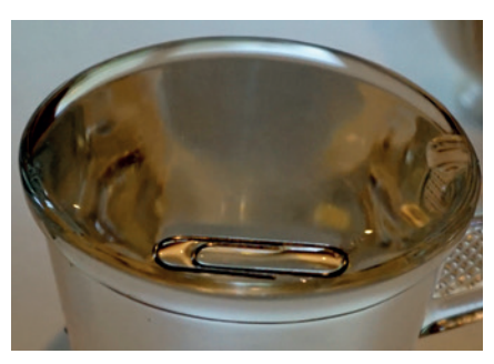
The structure of water molecules allows them to cling together strongly, forming a strong 'meniscus'.

For materials scientists, 'permeability' is measured by packing a column with the material of interest, and passing the liquid or gas (its 'mobile phase') through under pressure. For building conservators, the mobile phase is always water (although it may well be mixed with salts and other contaminants), and the behaviour of single materials is of little interest: we are concerned