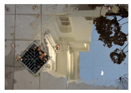
Water will not run uphill into a drain, and yet poorlypositioned drains are common.

water-vapour molecule to travel right through a permeable material of any thickness. Water vapour is most likely to be a problem if it forms enough condensation to drip or to run down as liquid. (Condensation on glass, for example, can lead to the decay or corrosion of window frames.)