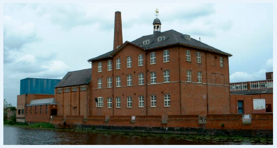
Cradle of Britain's spinning industry – One of the factories showcased in the Manufacturing Pasts digital archive is Friar's Mill. The Grade II building dates from the C18. By the early C20 Donisthorpe & Co Ltd were sending yarns and even 'artificial hair' across Europe from here. Following decades of decline, fire damaged the mill in 2012, after this photograph was taken. However Leicester City Council have bought it with a view to repair and conversion into managed workspaces, so its contribution to the economy is far from over.

At the same time the University has been working with the Record Office for Leicester, Leicestershire and Rutland to digitise hundreds of records of the city's industrial history which were previously in private hands or poorly maintained. 'Manufacturing Pasts' provides online access to help communities understand Leicester's industrial heritage, which is necessary as the city regenerates a number of its buildings at risk.