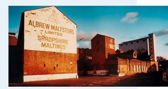
Ditherington Flax Mill in Shrewsbury

www.ditheringtonhlf.info/ www.flaxmill-maltings.co.uk