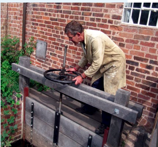
Above and below: volunteers at work at Sarehole Mill in Birmingham

compare notes, discuss milling and keep a written log, as well as an online blog at www.sareholemillers. wordpress.com . An account of the project has also been added to the Birmingham Archives & Heritage blog at www.theironroom.wordpress. com .