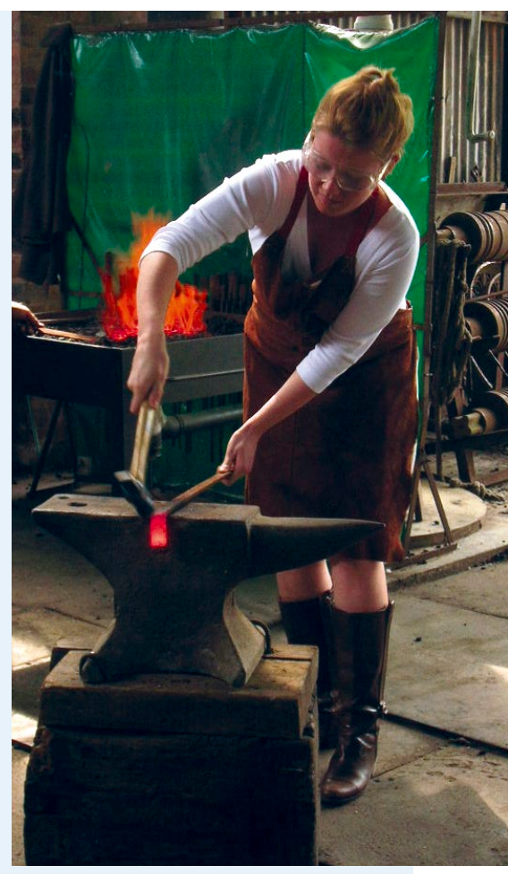
A student on the Ironbridge Institute's Metals course using a blacksmith's forge