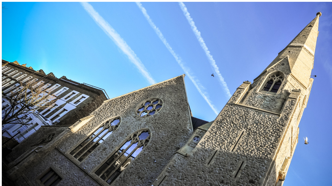
St Paul's Church (Photo: Boon Brown Architects).

Introducing private investment to the repair of heritage assets is understood to be a delicate balance of capital gain over sympathetic development and this project demonstrates how a clear and open relationship with all key stakeholders can deliver a successful project.