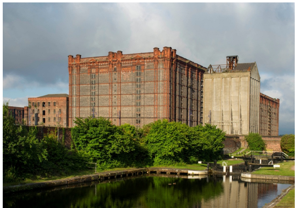
Work begins on the Tobacco Warehouse at Stanley Dock, Liverpool.

The restoration of the dock is therefore acting as a catalyst for the regeneration of the wider neighbouring area - and helping to re-join this area to the city centre. This is being achieved by using the attraction of the significant listed heritage of the conservation area, finding sustainable solutions for 'Buildings At Risk' with one aim ultimately being the removal of the conservation area from the Historic England 'Heritage At Risk' register.