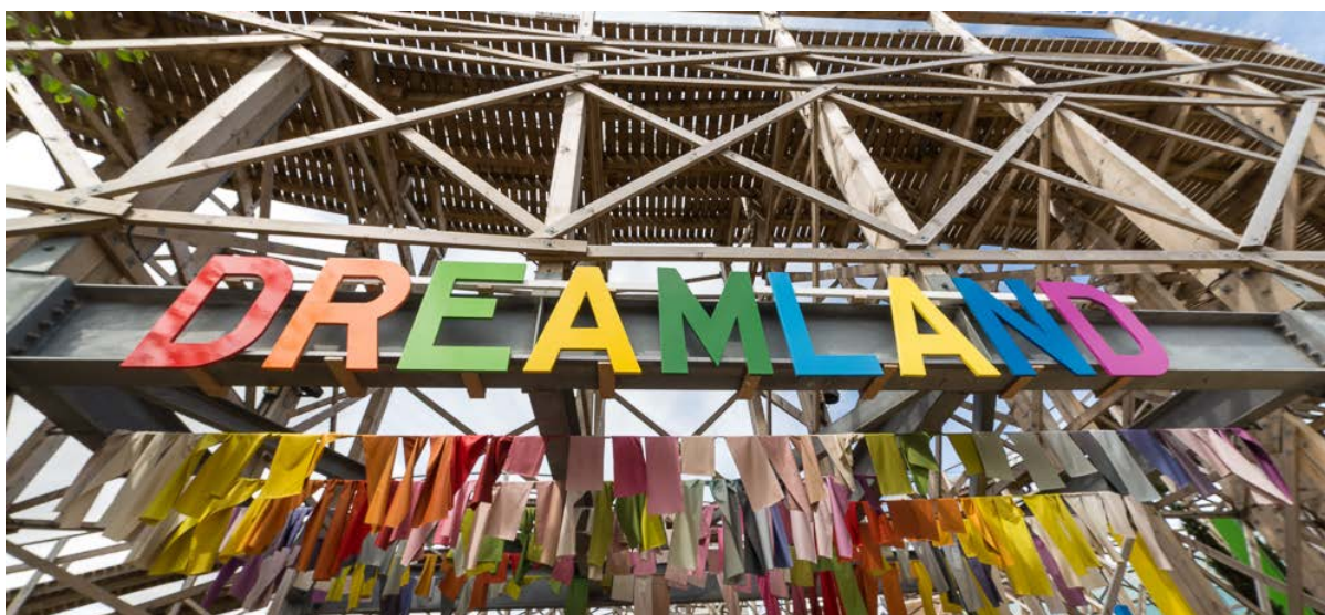
Dreamland, Margate.