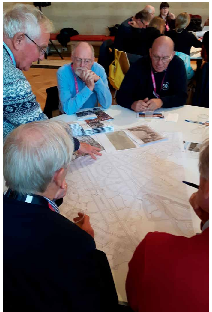
Image: Delegates at the Bristol Heritage Forum 'Conservation Areas at 50' conference.