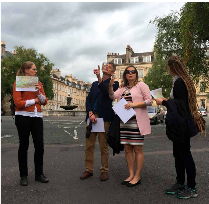
Image: HELM Conservation Areas training, Bath, June 2017