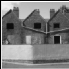
19-21 Stone Street before HERS

10 Advantage West Midlands. Delivering Advantage West Midlands Economic Strategy and Action Plan – Update, 2004-2010. CONSULTATION DRAFT.