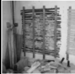
Wattle and Daub training wall