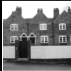
19-21 Stone Street in 2003