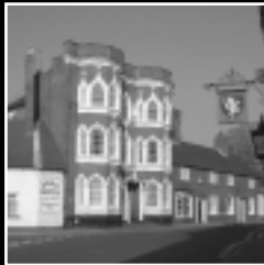
Speedwell Castle, Brewood Conservation Area

■ A SWOT analysis of the historic environment in the West Midlands was carried out in March 2003. 66% of conservation officers in the West Midlands responded. This unpublished survey, conducted on behalf of the Historic Environment Forum, is available to view at www.historicenvironmentforum-west.mids.org