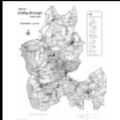
Dudley Borough in 1750