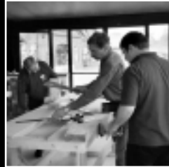
Rural Carpentry Skills Training