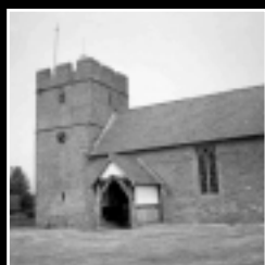
St Michael's Church, Onibury