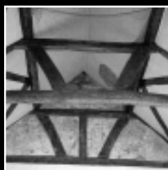
Falling ceiling plaster