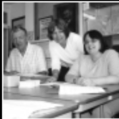
Community Volunteers from HART

5 Latest available figures from the Historic Houses Association.