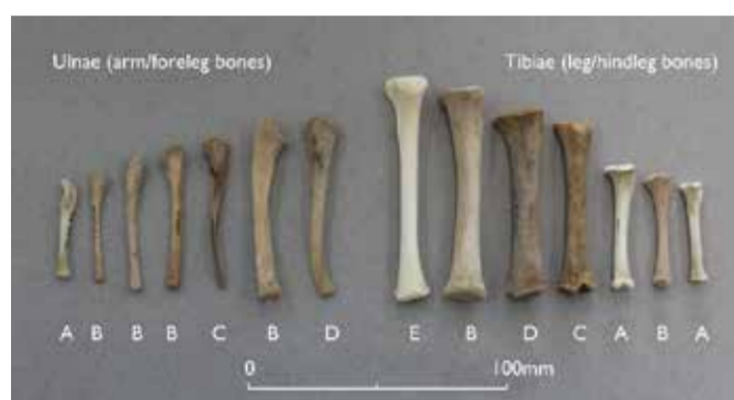
Fig S2.2 Neonatal and infant human remains can look very similar to young bones of animals. (A) fox; (B) human; (C) sheep; (D) cattle; (E) guinea fowl.