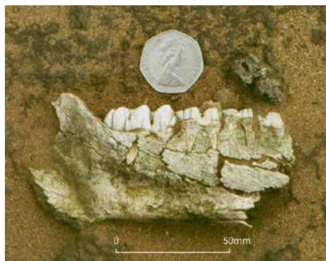
Fig S2.4 This pig mandible is likely to fragment and lose its teeth once lifted. All fragments and teeth must be kept together and not mixed with other bones and teeth from the context so that they can be used to age the animal.

Always make sure that you follow the project methods statement. This will reflect the needs of particular research questions, aims and objectives. Regular feedback between fieldwork staff (excavation and sample processing) and the zooarchaeologist can highlight changes to the excavation approach that will improve the interpretative potential of the bone assemblage.