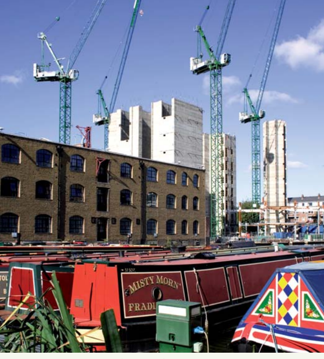
Development around the Regent's Canal, Kings Cross

By surviving into a more environmentally conscientious age, canals can now offer the potential to move large or heavy loads for a fraction of the energy consumed in road or rail transport and BW is keen to promote this where it is practical. One example is between Denham and West Drayton where carriage of aggregates by barge (the first major freight-transport contract on the Grand Union Canal for more than 30 years) commenced in 2003. An exciting project is Prescott Lock,