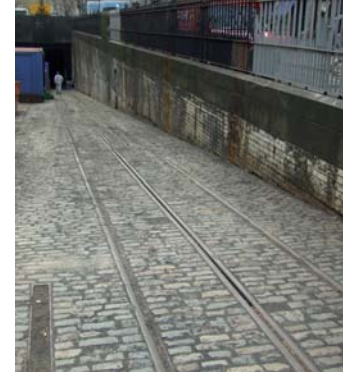
Kingsway Tram Tunnel

New tram links such as the CRT bring with them both challenges and opportunities for the historic environment. London is a complex