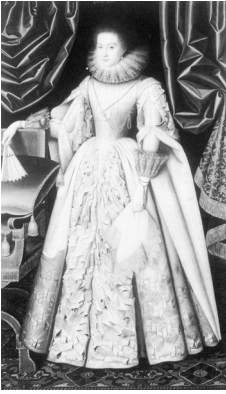
William Larkin's portrait of Lady Diana Cecil