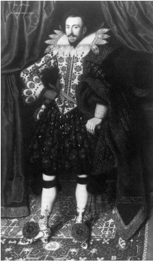
William Larkin's portrait of the 3rd Earl of Dorset

Another problem area was the carpet – a copy, reproduced by Larkin in meticulous detail, of the geometrical patterns on the oriental 'Lotto' carpets produced in Western Anatolia and imported into Europe in increasing numbers at this period. Here the crisp, geometric pattern in its bright primary colours of red, yellow, and blue had been lost by the darkening of the lead tin yellow pigment and the fudging by later restorers of areas of the pattern. The artist's intentions were so clear that it was possible to reconstruct the carpet to its original clarity and form. For the lace 'handkerchiefs' hanging from the garters, however, a different solution was adopted. Here, the smudgy 'impressionistic' effect was entirely out of character when compared with other pictures in the series – particularly that of the 4th Earl . Despite this, there was no evidence to show that this detail ought to have been better, so modern retouching was not carried out.