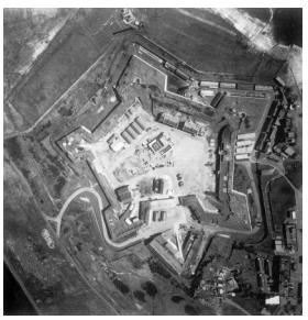
Aerial view of Fort Cumberland showing the storehouse/hospital in the centre and houses 1 and 2 just above/right