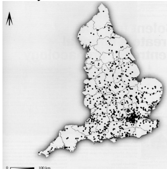
Distribution of field evaluations undertaken in England during 1994

The scale of archaeological endeavour is greater than ever. It is a multi-million pound business employing many more archaeologists now than it did even 20 years ago. Without doubt, the amount of work is increasing, resources are increasing, and it is up to archaeologists themselves to ensure that the quantity and quality of what is known about the past is increasing too. The academic community needs to innovate in the utilisation of data derived from commercially funded work; the gazetteers produced to date help that process by providing an index to what is available and what has been done. Equally, academic models have yet to be widely used and applied in the commercial or curatorial sectors. Perhaps the advent of a new generation of regional research frameworks will help rectify this situation.