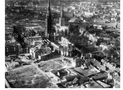
Coventry Cathedral, 9 February 1948: the symbol of the urban blitz and a landmark in post-war Coventry

This survey of information held in public records has demonstrated the diversity of source material available for study and its value as an archive, documenting views, policy issues, and conservation practice at a time when defence of the realm and food production were overriding priorities. The sources described illustrate – through some notable examples – the role of conservation in wartime England, highlighting the fact that, while many monuments were damaged in the name of home defence and specifically such things as airfield construction, conservation was still recognised as important by the War Department and the Ministry of Agriculture. Of course sixty years later the airfields and defence sites that were so damaging to archaeological remains at the time now form an important part of our heritage, with some of the best preserved and typical examples being afforded protection in their own right.