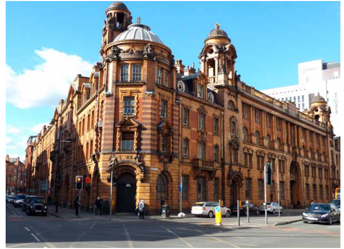
Figure 12 Manchester's magnificent Baroque Revival combined Fire and Police Station of 1901-06 includes plentiful accommodation for the firemen together with an opulent Coroner's Court; it speaks of civic pride at its highest level. Listed Grade II*.

Victorian and Edwardian police stations outside London were generally designed by the architects responsible for municipal buildings. The requirements for accommodation were broadly similar but the range of styles adopted tended to be wider: some, especially in rural locations, were sensitive to local vernacular traditions. Major divisional headquarters for the police were usually designed as part of a civic complex that included courts, a weights and measures office or a fire station (Fig 11). This led to complex and ingenious designs often wrapped up in grand Baroque elevations (see Courts above) as at Manchester's London Road Fire and Police station of 1901-06 by Woodhouse, Willoughby and Langham (listed Grade II*, Fig 12) where the group included flats for all the men, comparable to and generally of a better standard than contemporary local authority housing. The twentieth century favoured more restrained styles – neo-Georgian, or stripped classical, with occasional flourishes of Dutch expressionist outlines and ornamental brickwork – but planning remained complex and, if anything, became more sophisticated as municipal and civic functions were combined as is the case, for instance, at the Central Police Station, Magistrates Court, and Fire Station in Newcastle-