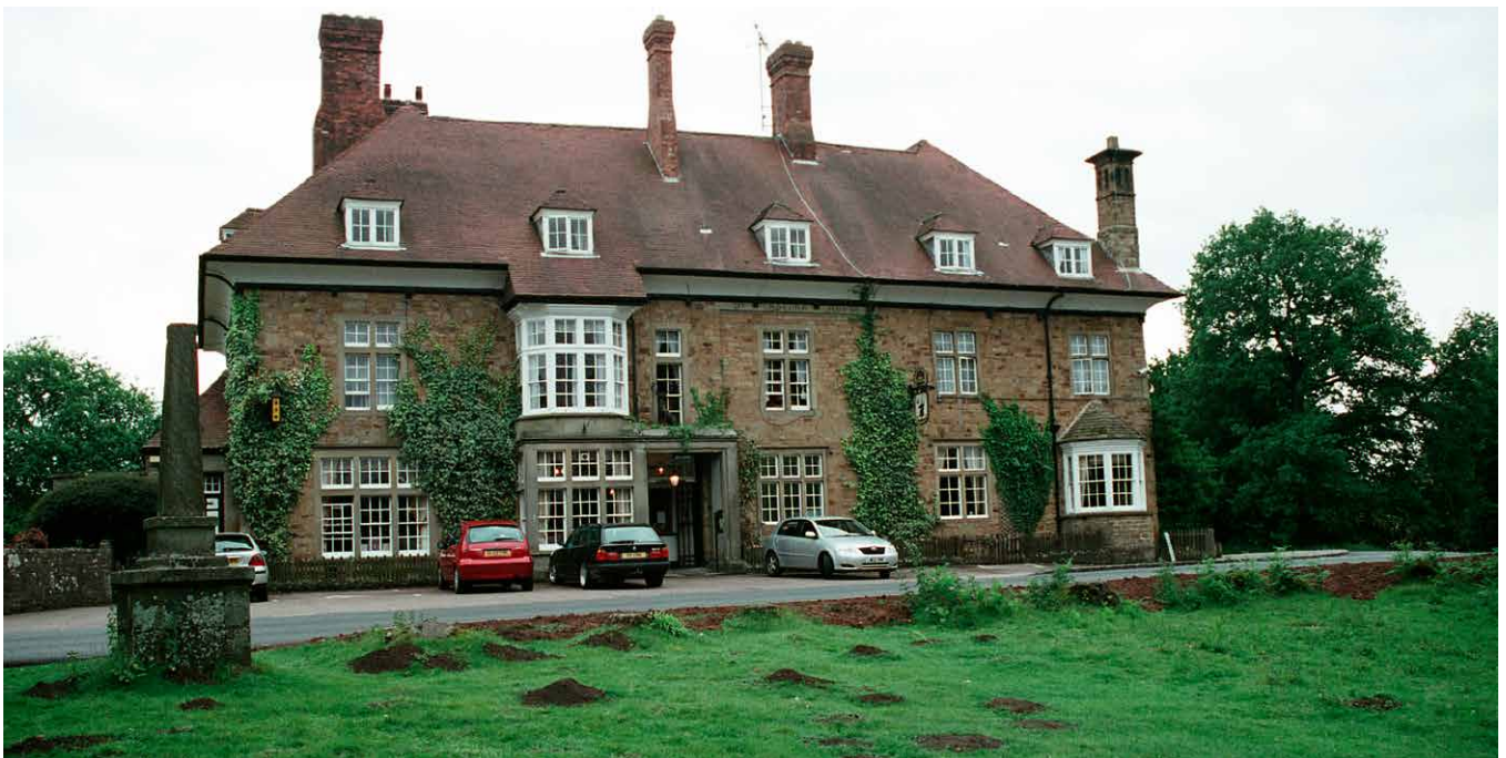
Figure 17 Speech House, in the Forest of Dean, Gloucestershire, was built in 1676 to accommodate the Verderers' Court

Many English regions had ancient courts reflecting their own local economy, especially those which regulated forests and woodlands and those associated with mining – tin in Cornwall, lead in the Peak District – before a more unified system of justice came in during the eighteenth and nineteenth centuries. Such courts typically met in private houses or pubs, although purpose-built structures are to be found: few are as ambitious as Speech House in the Forest of Dean, Gloucestershire, built for the Verderers' Court in 1676 (listed Grade II; Fig 17).