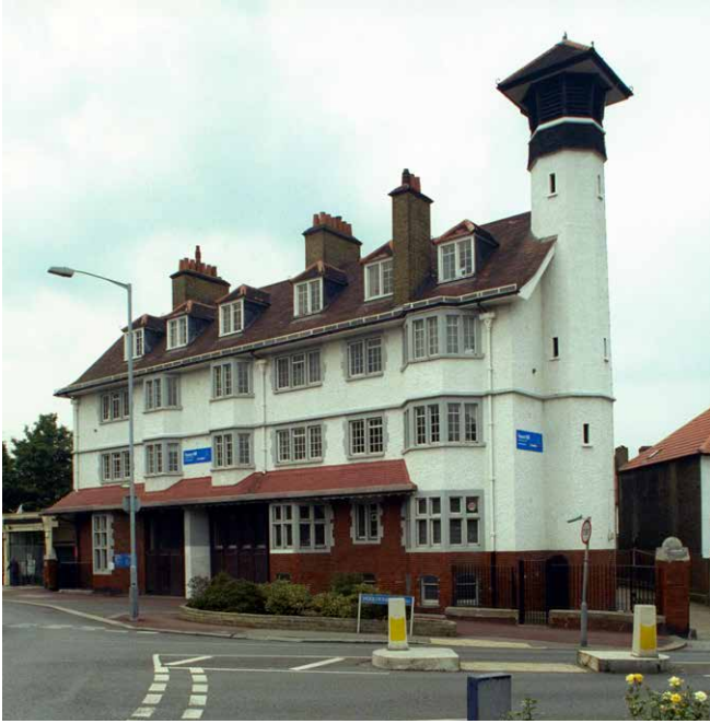
Figure 15 An extraordinary fire station design of 1901 from the inventive London County Council Architects' Department Fire Brigade Section. Mixing the Arts and Crafts Movement's regard for pragmatics with an unusual Japanese influence – is that a stair turret or a pagoda? – it is a local landmark on Catford's Perry Vale in the south London Borough of Lewisham. Listed Grade II.