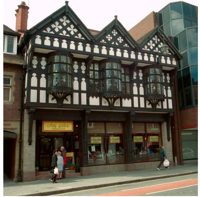
Figure 16 One of the more surprising designs for a fire station is this delicate neo-Tudor example of 1911 (now converted to commercial use) on Chester's Northgate Street. Its design responds not only to architectural fashion but also Chester's wealth of timber-framed architecture. Listed Grade II.

Borough of Lewisham (listed Grade II; Fig 15). Elsewhere, brigades were organised by the police, insurance companies, a variety of businesses, and private individuals.