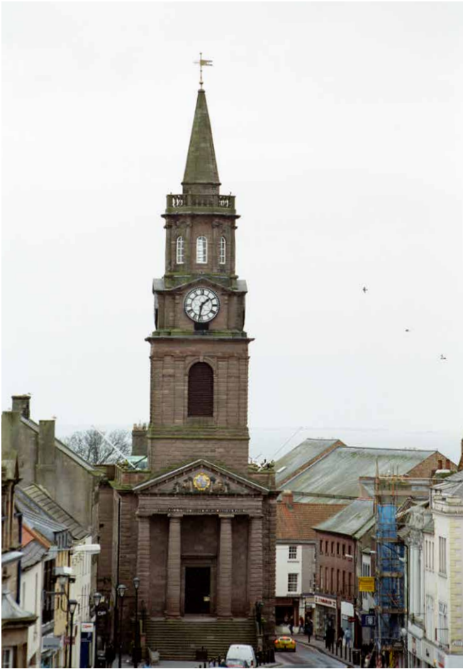
Figure 2 The Town Hall of 1754-60 in Berwick-upon-Tweed, Northumberland, also housed a gaol. It has a commanding presence standing, as was common, in the middle of the road. Its classical design by S and J Worrell has more than a passing resemblance to James Gibbs's famous church of St. Martin-in-the-Fields in London. Listed Grade I.

Examples range from Thaxted, Essex, 1390-1410 (listed Grade I), to Kingston-upon-Thames in south-west London, 1838-40 (listed Grade II*). Until the Municipal Corporations Reform Act (1835), boroughs (sometimes organised as formally constituted corporations) were private bodies that existed for the benefit of their members rather than the community at large. Their income was derived from property and levies on goods and transactions. Early modern examples such as Abingdon, Oxfordshire (by Christopher Kempster, 1678-80; listed Grade I), reveal how medieval approaches were brought up to date and given appropriate quarters for the growing responsibilities carried out by local bodies.