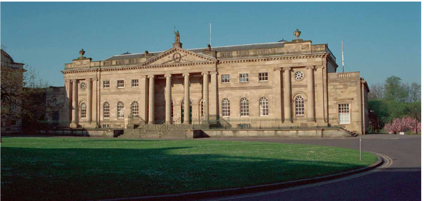
Figure 4 (top)

The western of two oval towers flanking the south entrance to Carlisle and forming the city's Court House. By Sir Robert Smirke, 1810-11, they are to a design originally by Thomas Telford. The eastern tower housed the civil court, and the western (above), the criminal court. Listed Grade I.