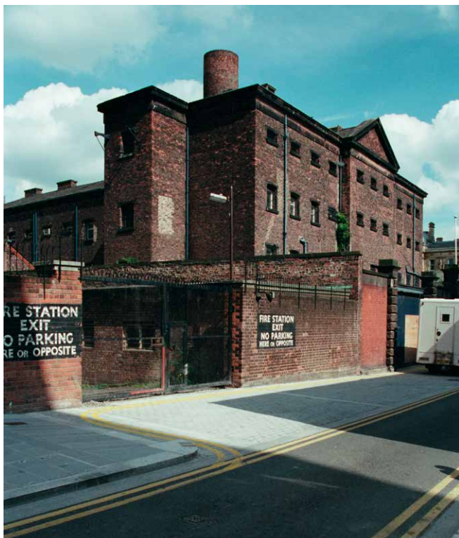
Figure 14 Liverpool's grim and forbidding Main Bridewell of 1860-64 – its name, from London's Bridewell, being a generic term for a prison – by John Weightman, still employs the classical language of architecture to raise it above the merely functional. Listed Grade II*.

built prison that became the model for prison discipline and design: Pentonville (London Borough of Islington; listed Grade II), designed by Col. Joshua Jebb for the Home Office (1840-42). It had a radial plan with four cell blocks around a central hall. The wings had three stories with cells on either side of an open central corridor, the upper tiers of cells being reached from galleries. Individual cells contained all the necessities of prison life but evidence for these has largely disappeared. It became the model for prisons until supplanted by Wormwood Scrubs in the 1870s, with its separate wings (below). By 1850 around 60 British prisons had been rebuilt or were being altered to conform to the separate system, and between 1842 and 1877 nineteen radial prisons were erected in England. In addition to new prisons, Pentonville-style wings were added to some prisons, while at others the existing buildings were altered or progressively rebuilt.