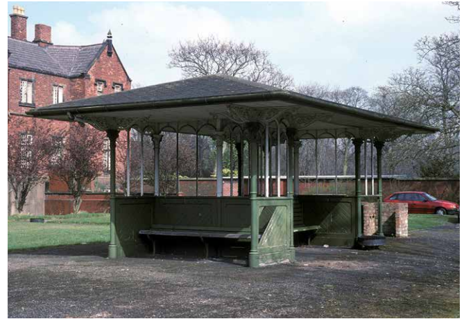
Figure 2 Manchester Royal Hospital for the Insane (now the Cheadle Royal Hospital), Greater Manchester, opened in 1849. Its therapeutic grounds (registered Grade II) provided for exercise, gardening and sport. This wooden shelter stands in the walled airing courts to the south of the Hospital.

cemetery. Not untypically there were productive gardens and even, beyond the main grounds, farmland where some of the male patients might work. Both gardens and farm supplied produce for the asylum kitchens. From the mid 1950s the airing courts at existing asylums were often opened up by the removal of boundaries, in order to provide a less confined atmosphere for patients.