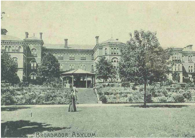
Figure 1 Broadmoor, near Crowthorne (Berkshire), opened as a special hospital for the criminally insane in 1863. Its design reflected a medical, rather than penal attitude towards the 500 male and female patients, who used the enclosed, terraced grounds for recreation. Seen here is the female airing ground in the late nineteenth century. Registered Grade II.