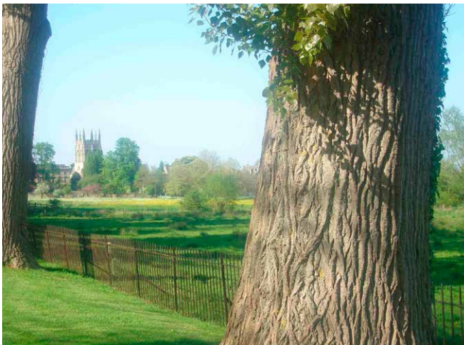
Figure 4 Christ Church, Oxford, also has walks through riverside meadows, part of its Grade-I registered landscape. There was already a perimeter walk by 1570, and access was augmented in 1863 when Dean Liddell (whose daughter, Alice, was the inspiration for Charles Dodgson's Alice) laid out the straight New Walk through the Meadow linking college and river.

At the Renaissance, college gardens became more expansive. At All Souls, Oxford, the years after 1574 saw the Warden introduce cut hedges, covered galleries, and intricate knot gardens, the last apparently based on exemplars in Thomas Hill's newly-published The Gardeners Labyrinth (1577). Some walks became more formalised, and planting was recorded along Christ Church's walks in 1624. The Civil Wars brought disruption to both places. In Oxford (the centre of the royalist cause from 1642-6) quadrangles became parade grounds and defences were constructed, and in Cambridge (where Cromwell was MP) orchards and walks were despoiled. After the Wars some of Oxford's defences were appropriated as garden features, such as Addison's Walk at Magdalene, banked above Oxford's water ditches, and the