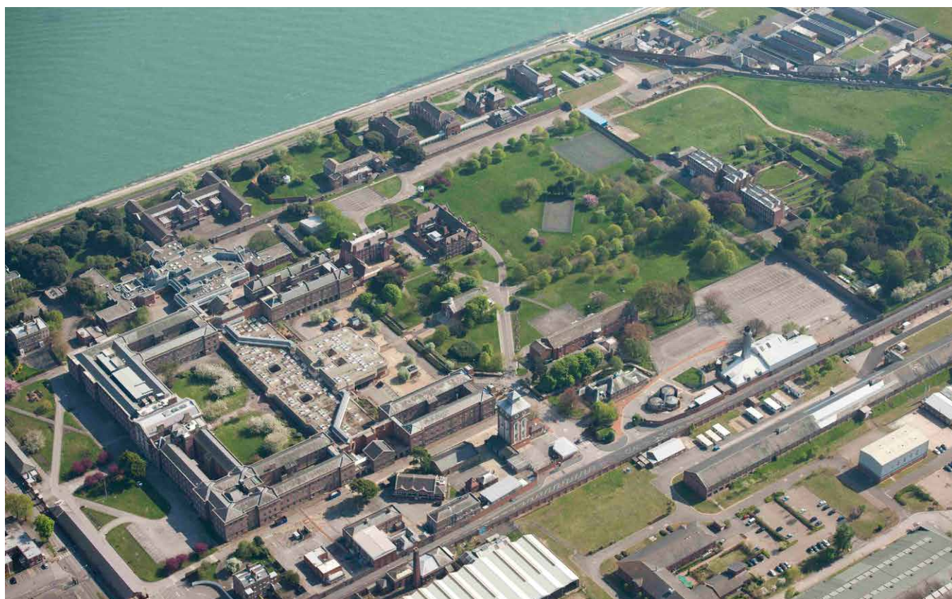
Figure 3 The Royal (Naval) Hospital, Haslar, Hampshire, opened in 1753: its design was highly influential across Europe. Its existing setting was further developed and formalised in the early nineteenth century with walled

Another social institution was the cottage home orphanage, with ‘village homes’ of a domestic character set within an ornamental designed estate. Early charitable examples include the Barnardo’s village homes at Barkingside (London Borough of Redbridge) of 1875 onwards, and the Harris Orphanage (now the Harris Knowledge Park, Preston, Lancashire; registered Grade II), laid out 1884-8 by Preston’s Parks Superintendent. In both cases the homes were grouped around a ‘village green’.