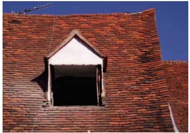
Figure 7 The cheeks, which are often the narrowest part of a dormer window, can be challenging to upgrade.

If, as is usual, the upgraded insulation of the dormer is not as thick as in the remainder of the roof there will always be a risk that condensation will form on the inside of the lining and also within the structure and insulation itself. Whilst this can theoretically be controlled by the introduction of a vapour barrier inside the new insulation, in practice it is virtually impossible to adequately seal such a barrier in a historic structure and it is in any case likely to trap and concentrate moisture against vulnerable fabric. The best way to avoid mould growth and deterioration of finishes is to use vapour permeable paints and breathable lime plasters