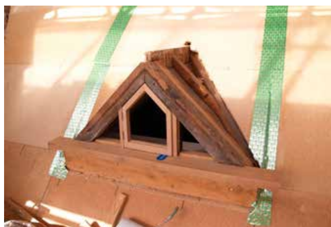
Figure 10 (top)

This simple apex dormer is relatively easy to upgrade along with the adjacent roof repair works.