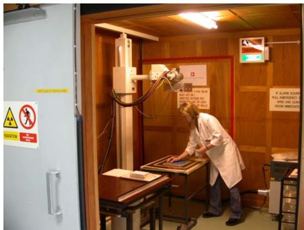
Preparing iron finds for x-ray photography

During this period the emphasis of the project has moved from the initial analysis of the fieldwork to focus on the work of the specialists. The specialist team at present comprises many individuals studying elements of the archaeology as diverse as glass, pottery, building materials, wall plaster, archaeobotany, animal bone, geology, coins, geoarchaeology and geophysics.