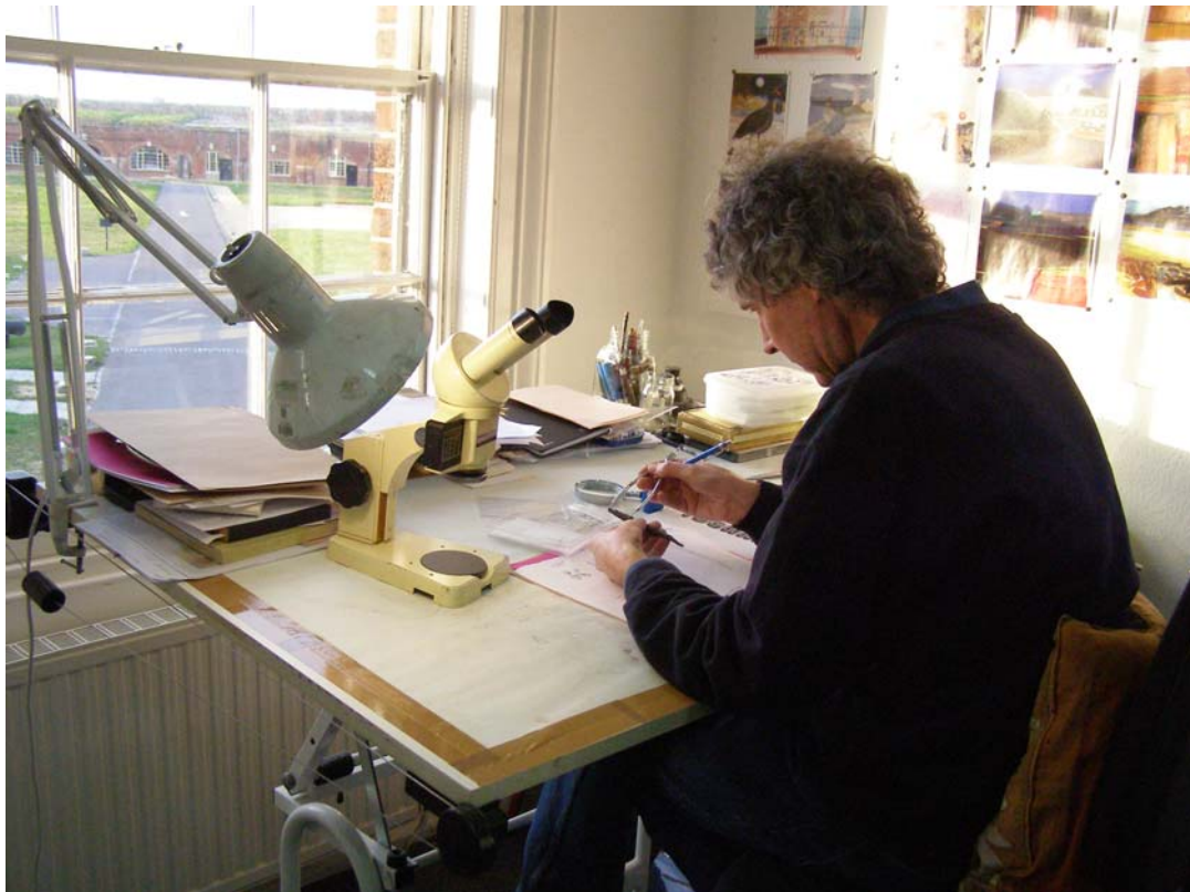
An illustrator at work preparing drawings for the final publication

All the finds from the Villa have now been washed, conserved and analysed. The next stage is therefore to select the items that have enough individual importance that they need to be accurately drawn to scale and photographed for the archive and so that they can possibly appear in the final publication. The importance of photography of special artefacts is obvious, but the drawing of them is, in some ways, even more important. The artefact in the hands of an experienced illustrator may often reveal details that cannot be seen in even the best photo, this is through careful scrutiny and the use of x-ray photos.