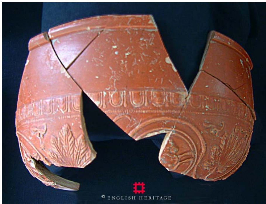
The pieced together remains of a decorated samian ware bowl

The individual styles of decoration found on the fineware have very limited life spans, much like some of today's designs and from these we can not only tell the date it was made, but also where in the Empire it came from, and if you are very lucky, sometimes a fragment is found that has the name of the potter on it. Coarsewares do not generally have designs on them and so it is more difficult to date these as the only way this can be done is by the style of the pot, but once a good shape was found for a pot this usually changed very little over the years.