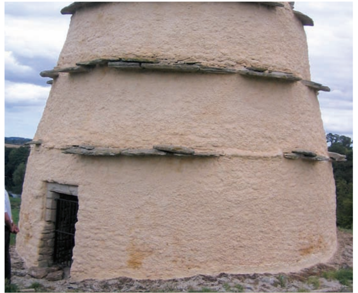
DOVECOTE AT BARFORTH HALL, COUNTY DURHAM

The Art of Consolidation – the dovecote pictured after repair works were completed.