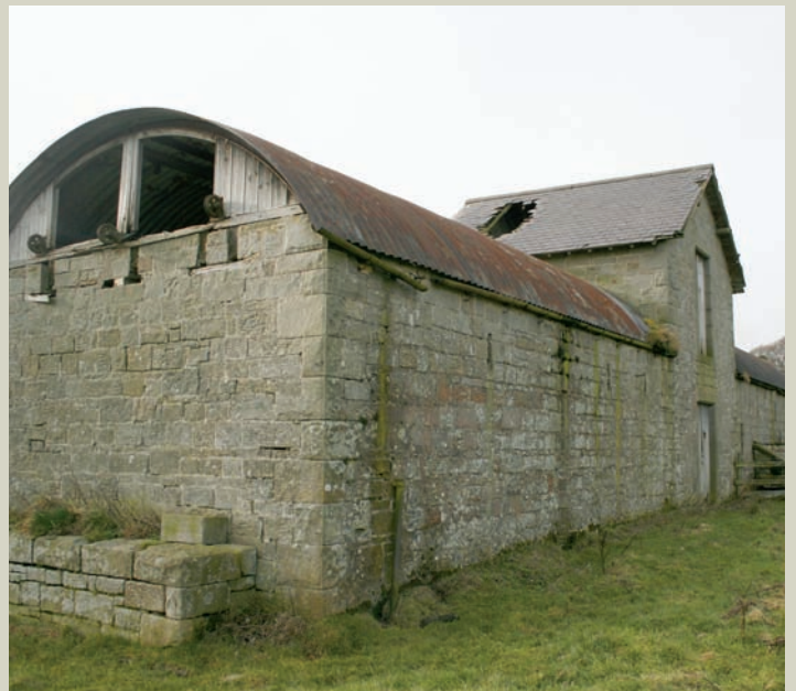
HYDRAULIC SILO, CRAGEND FARM, NORTHUMBERLAND Abandoned Experiment – this hydraulic silo is the legacy of a rare failed experiment by the great industrialist Lord Armstrong.