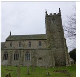
SITE NAME: Church of All Saints, Church Road, Hilgay DESIGNATION: Listed Place of Worship grade II* CONDITION: Poor PRIORITY CATEGORY: C (C) OWNER TYPE: Religious organisation LIST ENTRY NUMBER: 1077719

Brick west tower of 1794, remainder of carstone with ashlar dressings. Late C14 south aisle, nave and chancel. Slate roofs. Two-stage tower supported by angle buttresses to first stage, where belfry is set back at string course. Three-light timber west window. Roundels to north and south. Arched belfry windows with timber trellis screen. Rain and damp penetration to south vestry roof; rot in internal timber lintel; movement crack in vestry door. Below ground drainage suspect. Evidence of damp with instances of salt-affected plaster. The congregation have commenced with vestry repairs.