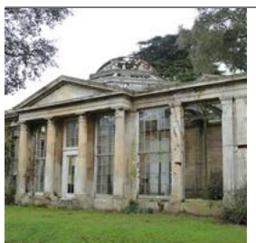
SITE NAME: Glevering Hall Orangery, Easton Road, Hacheston DESIGNATION: Listed Building grade II* CONDITION: Very bad OCCUPANCY: N/A PRIORITY CATEGORY: A(A)OWNER TYPE: Private

Orangery built in classical style c1835. Architect Decimus Burton. Glass missing, especially from the dome, and rusting iron cramps are forcing apart the stonework. Discussions regarding repair works ongoing.