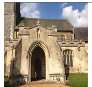
SITE NAME: Church of St Margaret, Little Green, Thrandeston Listed Place of Worship grade I, DESIGNATION: CONDITION: Poor PRIORITY CATEGORY: C (C) OWNER TYPE: Religious organisation

Medieval parish church dating from C15 apart from the C13 chancel, which was re-fenestrated in C15. The church was fully restored c1870-80. Short gabled north porch has a C19 outer arch. There is damp throughout the interior of the church, which is particularly bad around the pews at