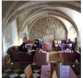
SITE NAME: Priory House (Council Offices), High Street south, Dunstable DESIGNATION: Listed Building grade II*, CA CONDITION: Very bad OCCUPANCY: Occupied/in use PRIORITY CATEGORY: A(A)OWNER TYPE: Local authority

C18 house on site of Priory guesthouse with C13 medieval undercroft and some pre-Georgian cellars. The undercroft, built in Totternhoe stone, is subject to complex structural movement and dampness issues. Excess surface water remains a significant agent of decay undermining the Totternhoe stone foundations and front wall causing further instability. Active and on-going project. Historic England continues to provide technical advice.