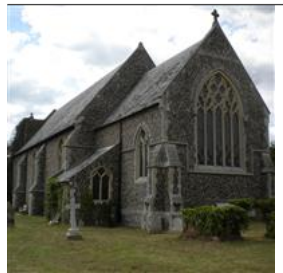
SITE NAME: Church of St Andrew, The Street, Alderton DESIGNATION: Listed Place of Worship grade II CONDITION: Poor PRIORITY CATEGORY: C(C)OWNER TYPE: Religious organisation LIST ENTRY NUMBER: 1377186

Parish church with ruinous west tower. Chancel rebuilt in 1862 and the nave restored in 1864. The condition of the drainage and guttering is unclear; however, there is significant evidence of damp within the church interior. The ruinous tower is blocked off from the nave and is overgrown by trees and shrubs. Slow decay continues; no solution yet agreed for either the church or the ruinous tower. Ivy growth partially killed off; some work appears to have been completed. Review required.