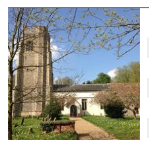
SITE NAME: Church of St Mary, The Street, Horham DESIGNATION: Listed Place of Worship grade II* CONDITION: Poor PRIORITY CATEGORY: C(C)OWNER TYPE: Religious organisation LIST ENTRY NUMBER: 1032540

Medieval parish church. Core of the nave probably dates from C12 and contains C12 doorways. The chancel was largely rebuilt 1879-8. Beneath all the belfry lights is square flushwork. The nave seating includes CI5 benches with poppyhead ends, enriched with buttressing and fleurons. The principal issue is damp, particularly on the external walls of the nave.