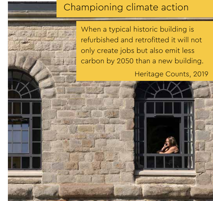
Brandon Yard, Bristol. A good example of sensitive repurposing of buildings