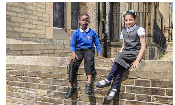
Pupils at Feversham Primary Academy in Bradford, which has been part of the Heritage Schools network since 2016

*Heritage Schools Evaluation Research 2019–20