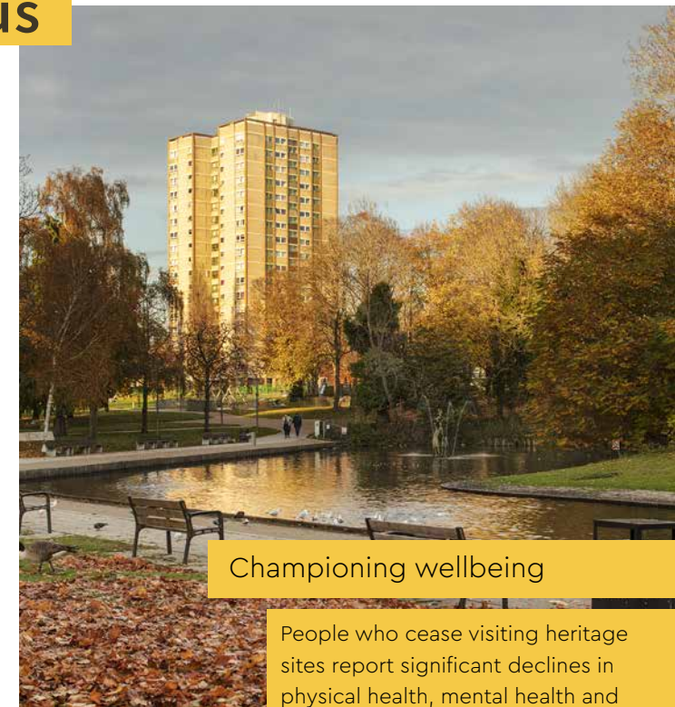
Stevenage Town Centre Gardens. The town centre Conservation Area is currently on the Heritage at Risk Register

We will inspire and equip people to take action in support of the places they care about.