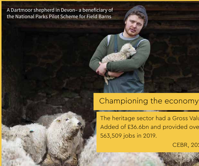
A Dartmoor shepherd in Devon – a beneficiary of the National Parks Pilot Scheme for Field Barns

Our Strategy outlines the route and steps we can all take to better serve and safeguard our heritage. Our Values will guide the decisions we make along the way.