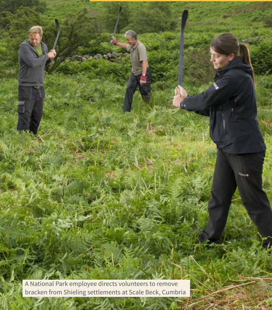
A National Park employee directs volunteers to remove bracken from Shieling settlements at Scale Beck, Cumbria

We will inspire and equip people to take action in support of the places they care about.