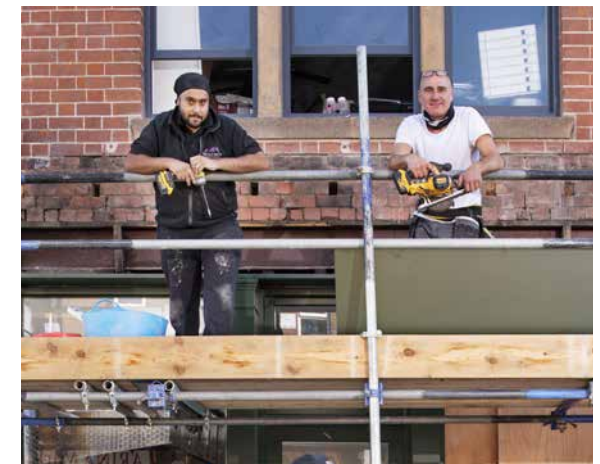
Craftsmen reinstating traditional shop fronts in Hales Street, Coventry, as part of the High Street Heritage Action Zone

These schemes will transform underused and dilapidated buildings on the high street into new homes, shops, workplaces and community spaces, enhancing historic character. By working with local authorities, businesses and communities, we'll help renew high streets across the country, reinvigorating places with much needed grants and initiatives such as the High Streets Cultural Programme.