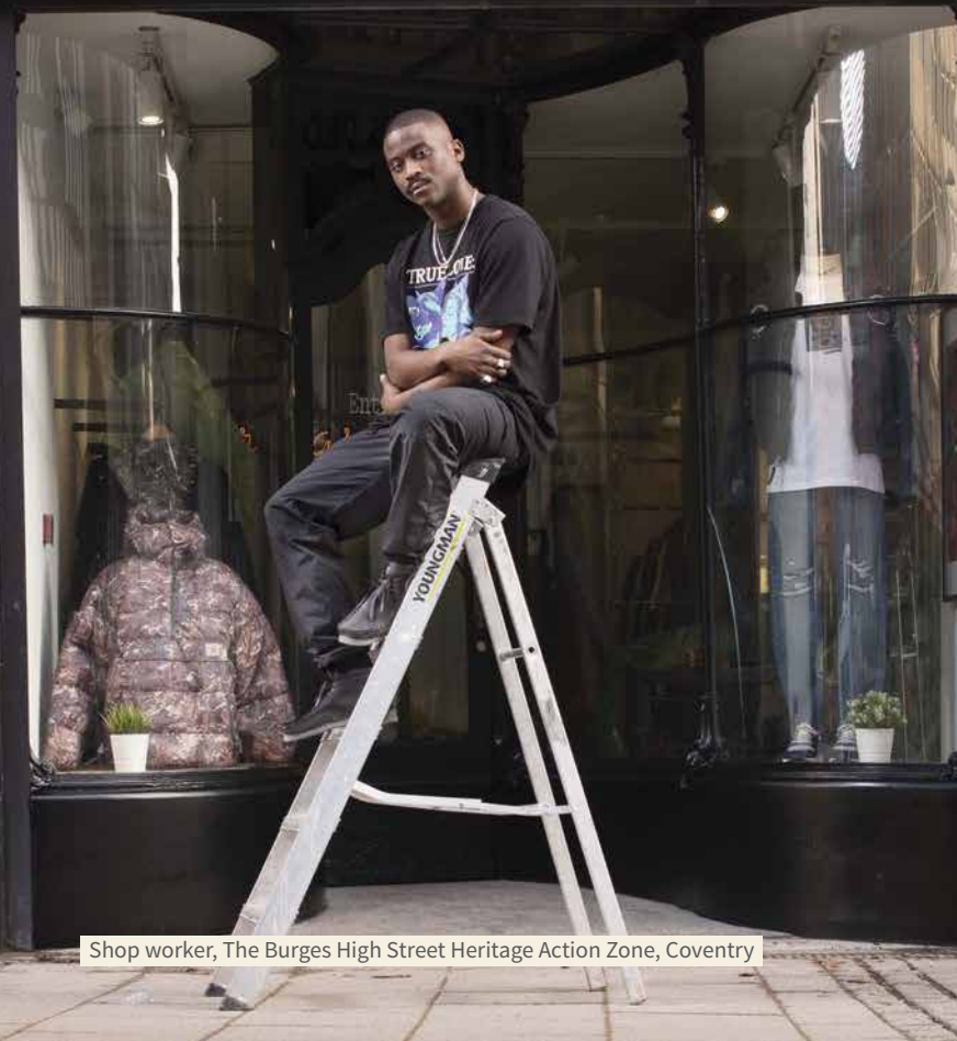
Shop worker, The Burges High Street Heritage Action Zone, Coventry

We will collaborate with people and partners to secure vibrant and sustainable futures for historic places.