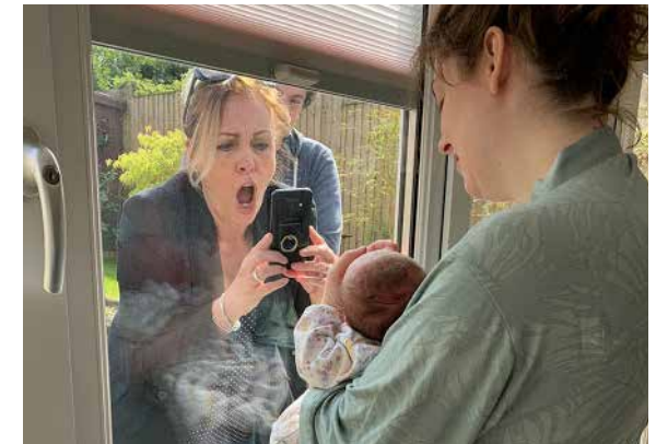
Picturing Lockdown Collection: first sight of her first grandchild

We also carry out projects that inspire the public to add their own content to the Archive. This was recently highlighted by the Picturing Lockdown project in which we asked the public to submit photos to document their experiences of one week in lockdown during the Covid-19 pandemic.