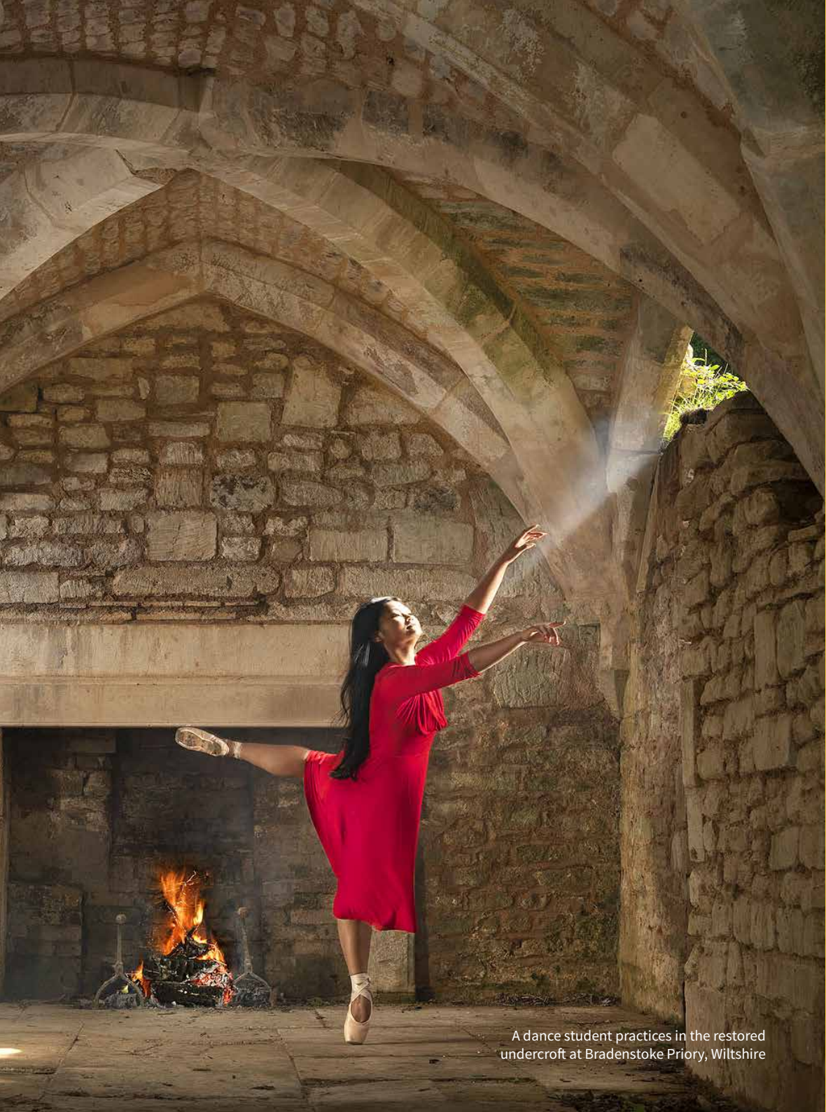
A dance student practices in the restored undercroft at Bradenstoke Priory, Wiltshire