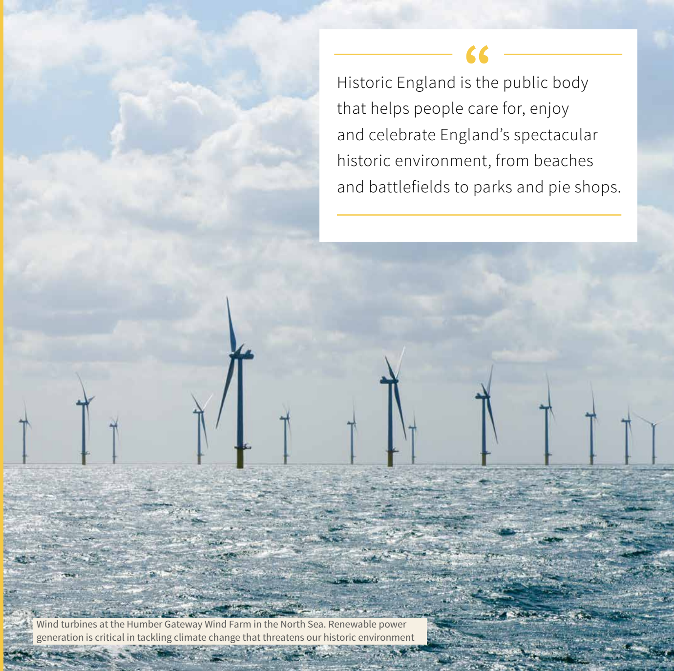
Wind turbines at the Humber Gateway Wind Farm in the North Sea. Renewable power generation is critical in tackling climate change that threatens our historic environment

Historic England is the public body that helps people care for, enjoy and celebrate England's spectacular historic environment, from beaches and battlefields to parks and pie shops.