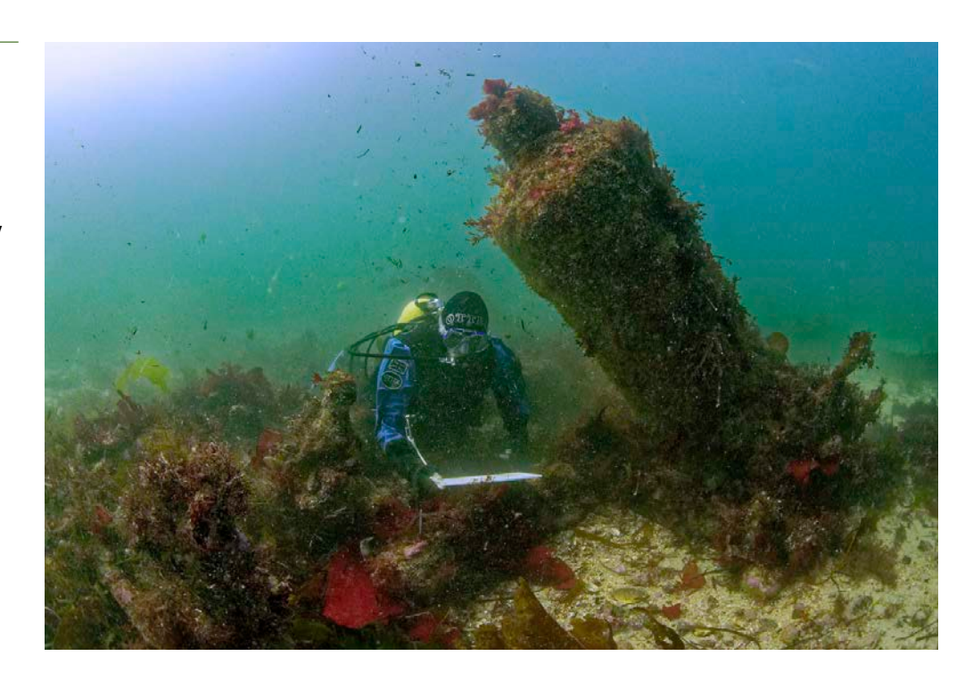
Figure 4: A diver surveying on the wreck of HMS Colossus , Isles of Scilly.