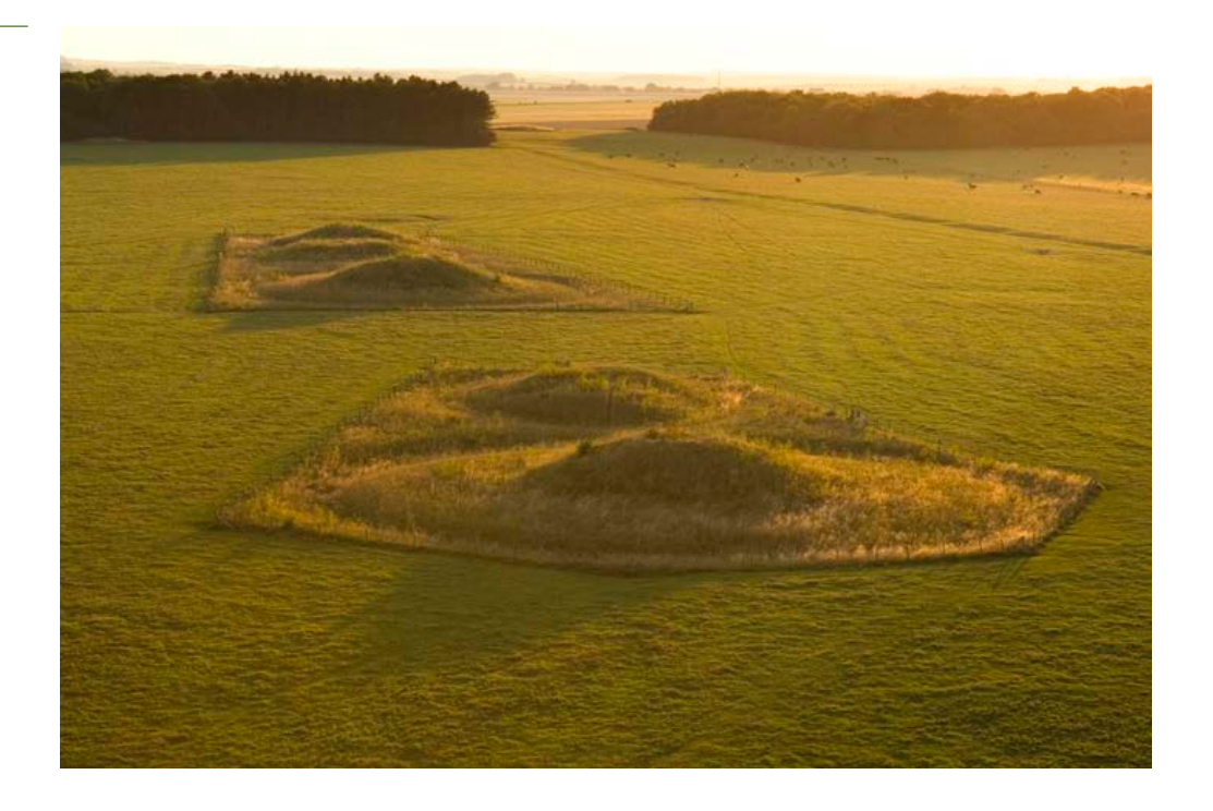
Figure 3: The Cursus barrow group and the Cursus in the World Heritage Site at Stonehenge, Wiltshire.