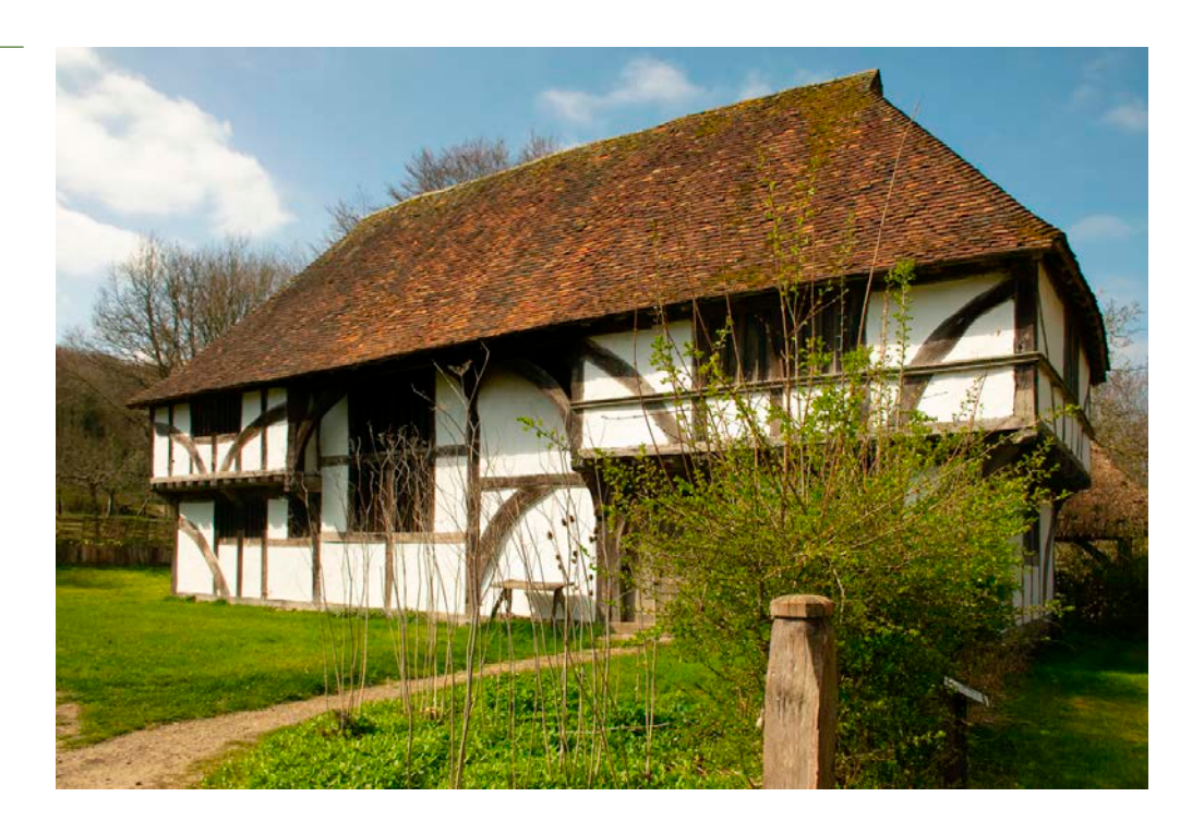
Figure 2: Bayleaf Farmhouse, a timber-framed Wealden hall house originally from Chiddingstone in Kent, re-erected at the Weald and Downland Museum in Singleton, West Sussex. © Andy Bliss