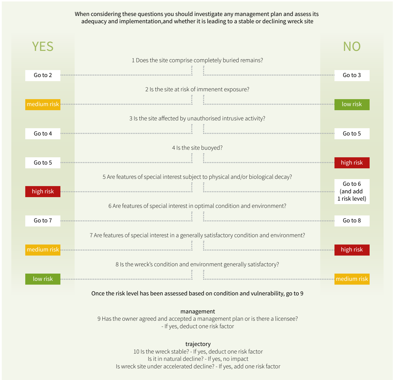
Figure 3 Risk Decision Tree to be used in conjunction with Category Band Definitions and Codes.