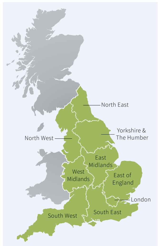
Figure 2 Historic England regions.

http://ads.ahds.ac.uk/oasis/lists/wordlists.cfm#landuse