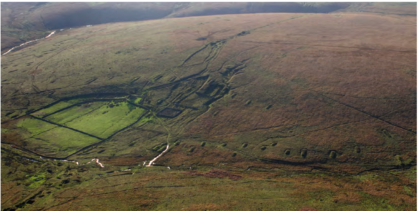
Figure 5 Aerial photograph of Huntingdon Warren, Dartmoor. The ditched pillow mounds can be seen running along the valley in the foreground with a second line beyond.

Archaeological excavations have proven that rabbits were eaten in Roman Britain, but no further trace of them is found until after the Norman Conquest. The earliest written source is a grant of land to Plympton Priory, cum cuniculi (with rabbits), in 1135. Henry III established one of