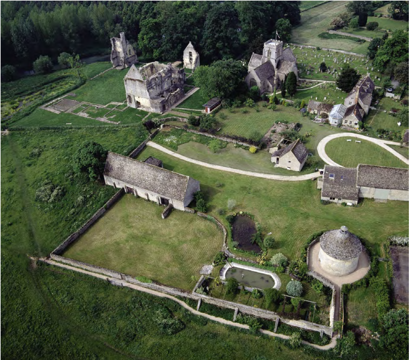
Figure 3 Minster Lovell, Oxfordshire. This 14th century manorial complex features a circular dovecote (bottom right) and several fishponds. The remains of one can be seen far left.

villa complex. It has been suggested that Romano-British fishponds can be categorised by size but with few known examples this may not be meaningful.