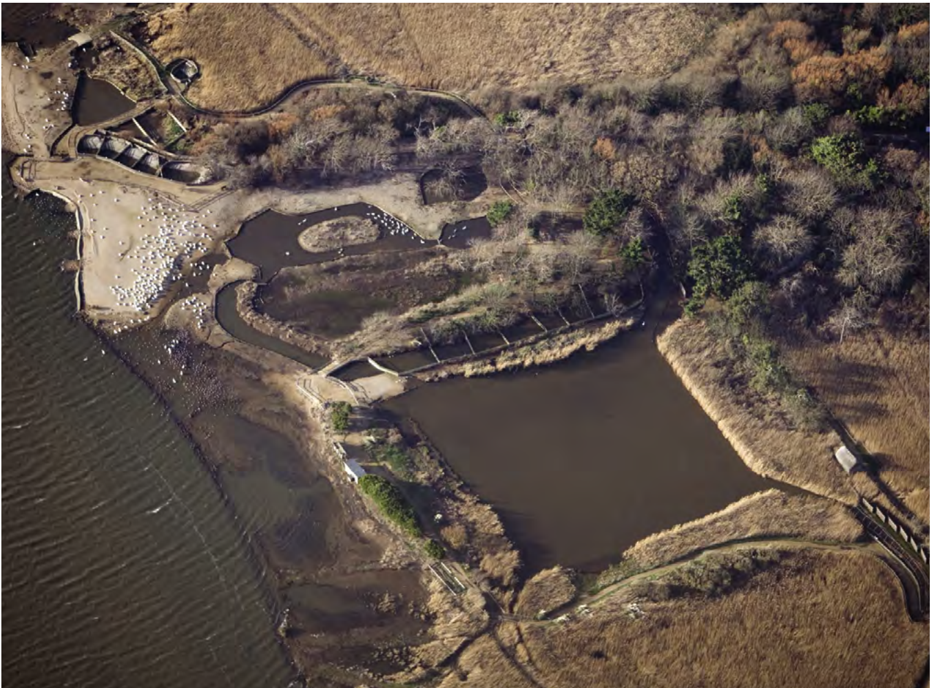
Figure 6 Aerial photograph of Abbotsbury Swannery (Dorset). Originally a typical square duck decoy pond with a pipe at each corner. That at bottom right remains in use and the frame, nets and screens are visible. The others have silted up or been modified.