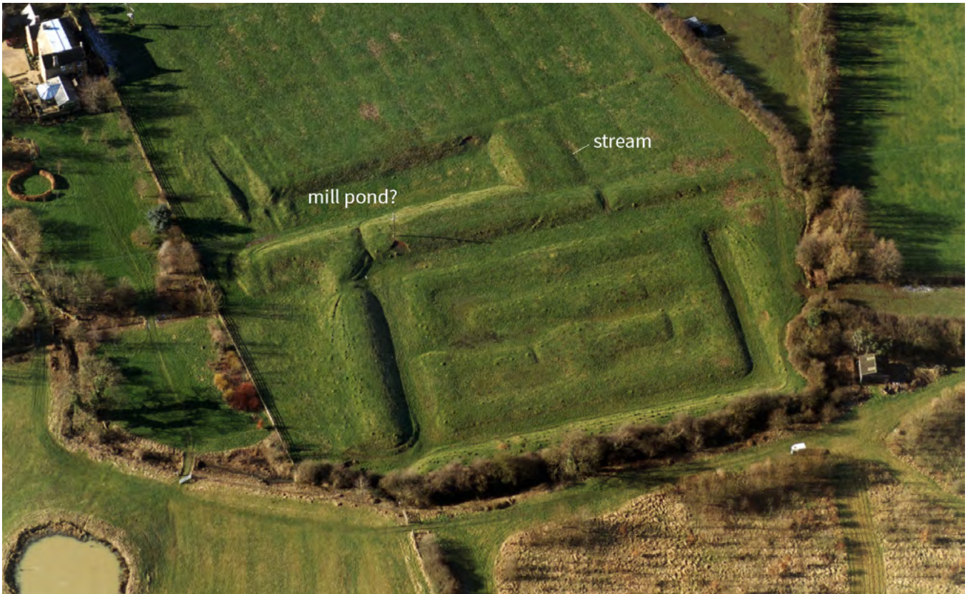
Figure 4 Aerial photograph from the south-east of the Bishop of Lincoln's impressive fishpond complex at Lyddington, Rutland. Water entered the complex from a small stream at top right. The pond to the west is secondary and may have powered a mill.

Most medieval fish-management sites had multiple ponds, typically two or three, but occasionally up to 12. Sometimes all were similar but in others they were of different sizes; the smaller ponds perhaps for breeding, the larger for stock rearing. In simple medieval examples, ponds located on valley floors could be flooded with fresh water by diverting a stream through them. Arrangements were usually more complex: water was channelled to the ponds along input leats and carried away by outlet leats, while bypass channels controlled fluctuations and prevented flooding. The leats could be several metres wide, about a metre deep and, in extreme cases, 1km long. The flow of water was controlled by sluices and their former positions can sometimes be seen.