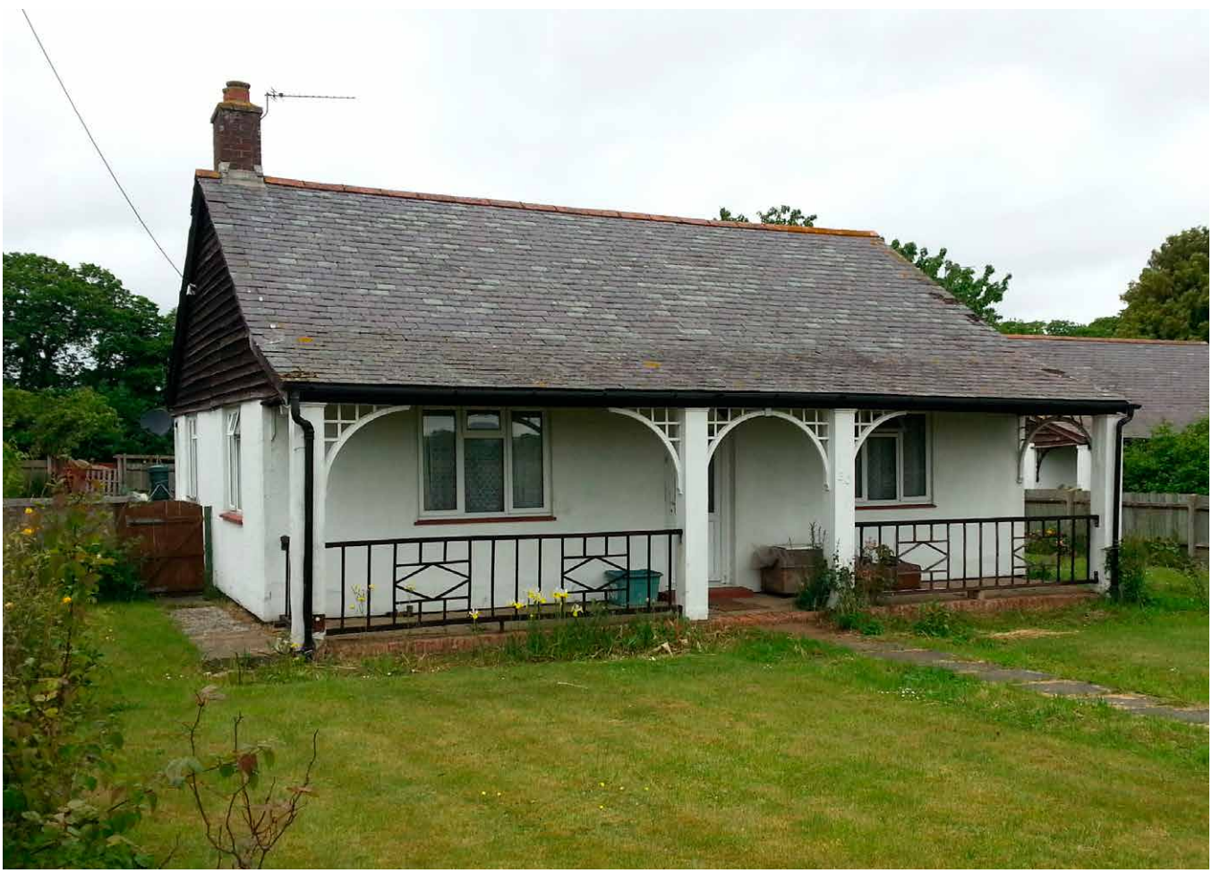
Figure 9 (above)

Bungalow, 1923, at Preston Hall British Legion Village near Maidstone designed for veterans with tuberculosis. The verandah provides sheltered access to the fresh air, considered important in treatment at that time.