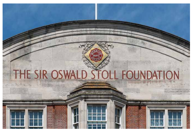
Figures 16 (top) and 17 (bottom)

Top: War Seal Mansions, Fulham Road, London started in 1917 and completed 1923. Built for disabled veterans by theatre and cinema impresario Sir Oswald Stoll (who also built and owned the London Coliseum), this large block of flats on three sides of a central garden square contained on-site medical and rehabilitation treatment facilities for the tenants. Bottom: Detail of the mosaic War Seal emblem from the facade of War Seal Mansions. Stoll raised funds partly from the sale of halfpenny 'War Seal' tokens at his cinemas and theatres during the war years.