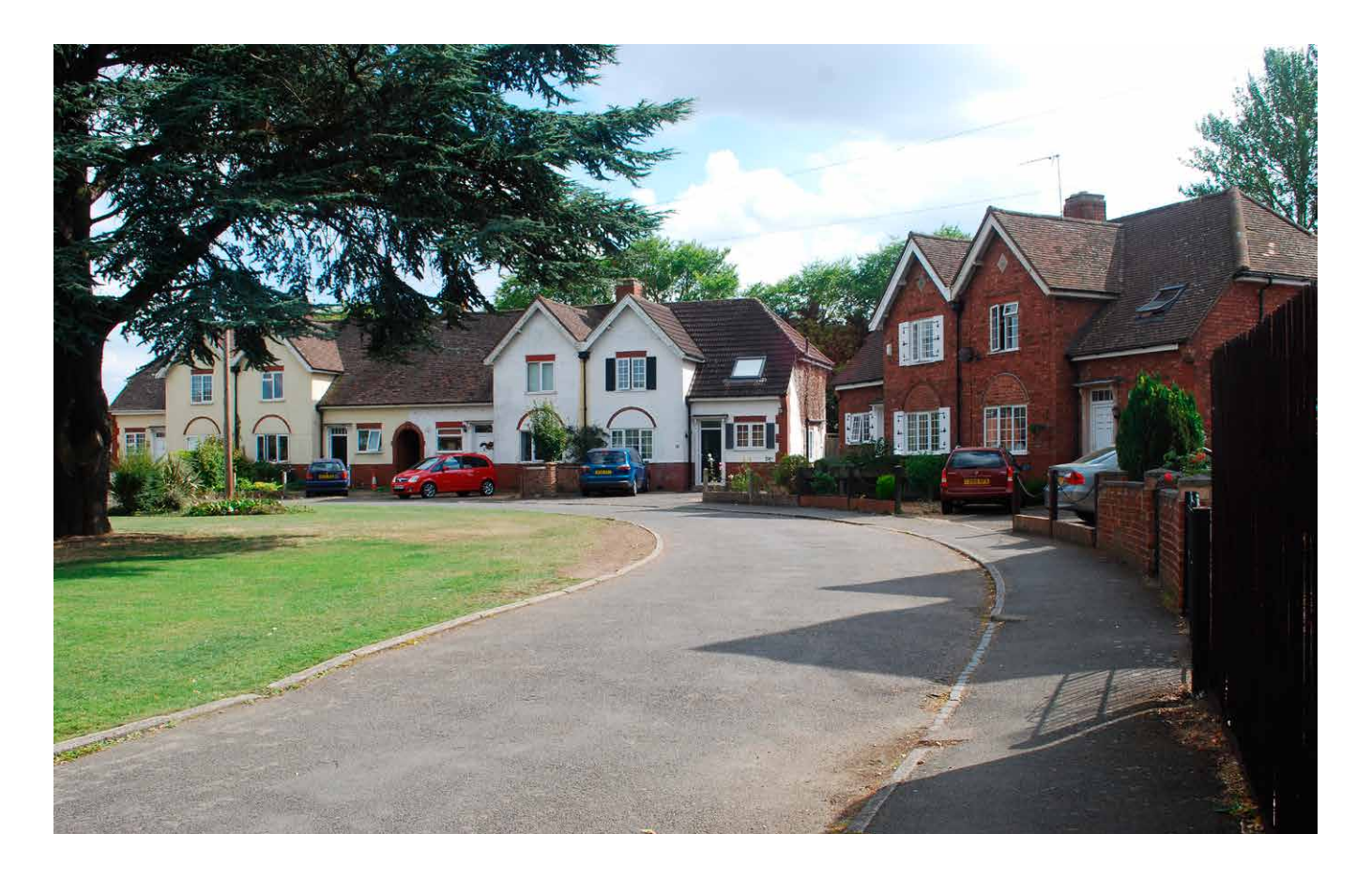
Figure 18 Twelve houses for disabled veterans at one of the British Legion's larger sites, Legion Crescent, Rothwell Road, Kettering, Northamptonshire.

The foundation stone was laid in 1928 by the Duke of Buccleugh who donated the land.