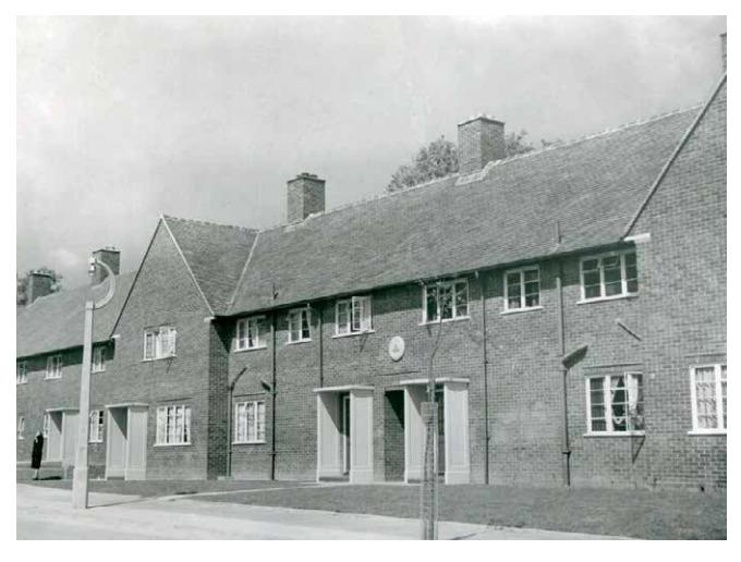
Figure 31 Royal Artillery Memorial Fund Housing at Artillery Place, Harrow Weald designed by F.N.Saunders 1950.

Similar partnerships between Haig, the British Legion, Royal Air Force Benevolent Fund and the Corps of Royal Engineers produced Haig Homes estates dedicated to housing veterans from these organisations. These are often individually marked by identifying plaques.