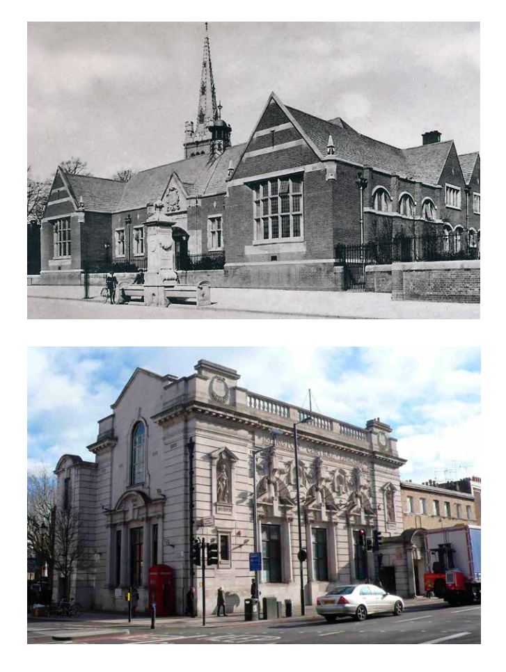
Figure 3 (top)

The library at Kettering (Northamptonshire) by Goddard, Paget and Catlow, an Arts and Crafts essay in brick and Ketton stone with a Collyweston slate roof, seen here soon after its 1904 opening by Andrew Carnegie. The library is the focus of a fine civic group with the Dryland fountain (c.1907), the neoclassical Alfred East Art Gallery (1913) and Kettering's war memorial (1921). All are Grade-II listed.