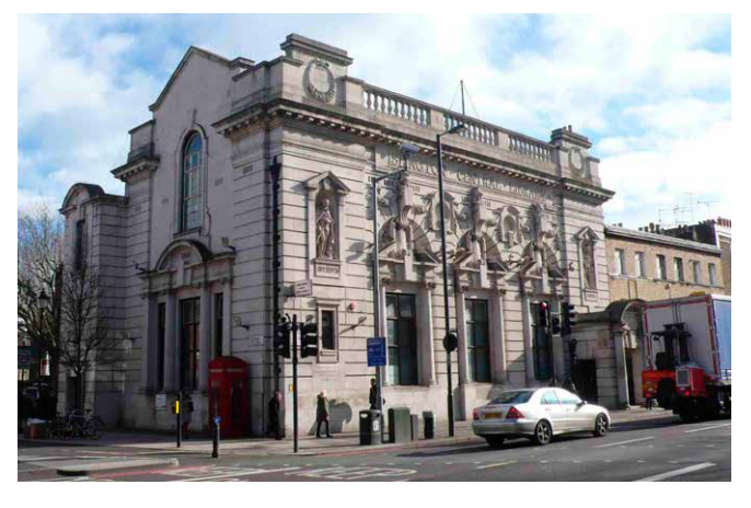
Figure 3 (top)

The library at Kettering (Northamptonshire) by Goddard, Paget and Catlow, an Arts and Crafts essay in brick and Ketton stone with a Collyweston slate roof, seen here soon after its 1904 opening by Andrew Carnegie. The library is the focus of a fine civic group with the Dryland fountain (c.1907), the neoclassical Alfred East Art Gallery (1913) and Kettering's war memorial (1921). All are Grade-II listed.