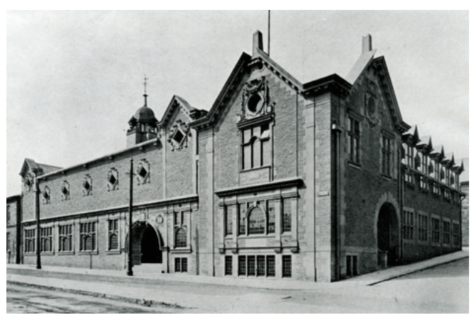
Figure 1 (top)