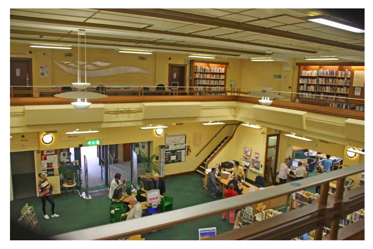
Figure 16 Torquay Library, Torbay (listed Grade II). This was refurbished in 2004 after close consultation with users. The aim was to update the facilities whilst retaining the Art Deco features. Where original wooden shelving was replaced, bespoke Art Deco wooden end panels

were made for some of the new shelving units. The impressive central glazed ceiling was painted over for easier maintenance, and new Deco-style light fittings installed.