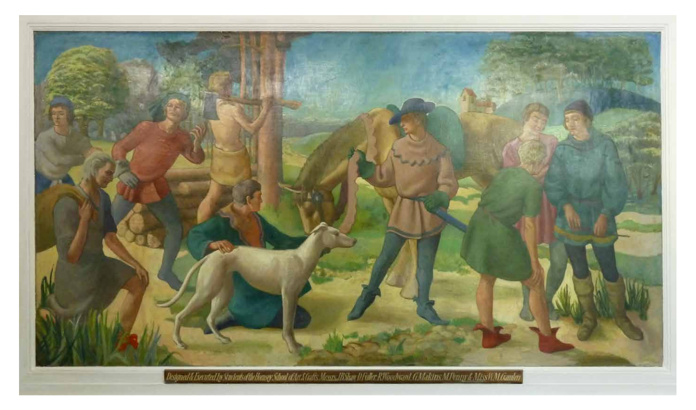
Figure 10 Muswell Hill Library, London Borough of Haringey, listed Grade II. The inter-war trend for providing a richer library experience for readers produced this mural in Muswell Hill's first-floor children's library; it depicts scenes from local history, painted by students