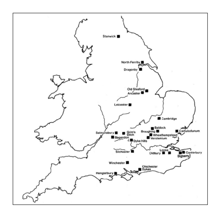
Figure 1 The location of major oppida shows a strong bias to central and eastern regions of England. Their form varies greatly ranging from small, single, enclosures, through to extensive spreads of polyfocal settlement, religious and industrial foci. The best known examples are also the largest – Camulodunum, Verulamium, and the Chichester Dykes each cover several square kilometres

regions of the country, particularly close to the Thames Valley and other river systems that feed into the North Sea. In total there are approximately 20 sites in England that have been termed 'oppida'.