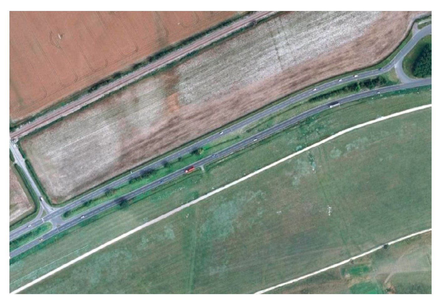
Figure 8 The triple linear ditch system at Therfield Heath, Hertfordshire, can be seen as three, narrow, parallel lines running from top to bottom to right of centre. These are likely to be the north-eastern boundary of a large unenclosed oppidum centred on Baldock several kilometres to the south-west.