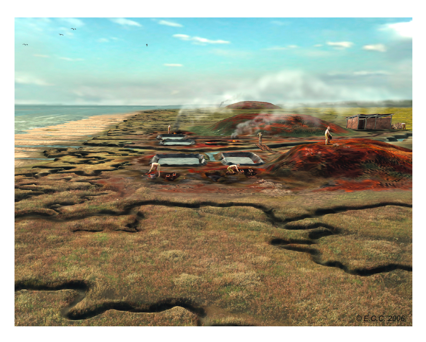
Figure 4 A reconstruction by Roger Massey-Ryan of Romano-British salterns in operation (forming 'red-hills' in the process) along the Essex coast, based on excavated on Canvey Island in the 1960s.

Other features of the later coastal industry include, sluices, large kinches or sleech pans (which might be rectangular or, in Cumbria for example, circular and sometimes embanked), and traces of buildings: workshops (or 'coates'), hot-houses for drying the final product and sheds for storage. The archaeological evidence for early inland saltworks bears many similarities to that seen on the coast, such as the clay- and stakelined brine tanks, brine hearths and briquetage common to the late Iron Age industry in Droitwich.