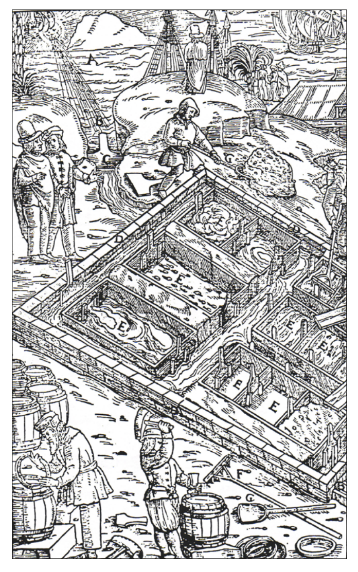
Figure 2 Georgius Agricola's idealised view of a sunworks in De Res Metallica (1559).

Having achieved a strong enough brine (the specific gravity of which could be tested by