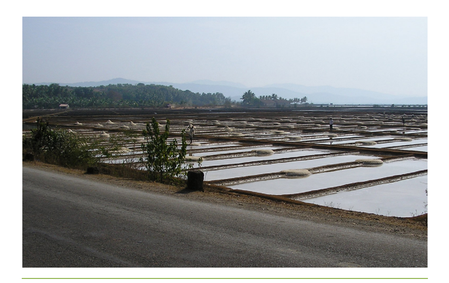
Figure 1 A solar evaporation system, or salina, in operation near Udapi on the Malabar coast, southern India.

salterns, in all periods, were attracted to areas with the highest saline concentration, avoiding deep waters and regions diluted by rivers and high rainfall, and often exploiting small inlets and tidal marshlands which were subject to natural evaporation. Early inland salterns were drawn to the highly saline springs which issued from the Triassic salt beds along the western side of England between Cumbria and Somerset – in particular those beneath Cheshire and northern Shropshire, and centred around Droitwich in Worcestershire.