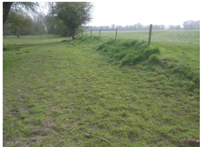
Figure 5 View along the Elmore 'Great Wall', Severn estuary, showing the difference in elevation of land either side of the former line of the embankment.

it; the greater this elevational difference, the earlier the reclamation. Even if the bank is later removed following progressive land-claim, its line often survives as a scarp separating areas of different elevation (Figure 5).