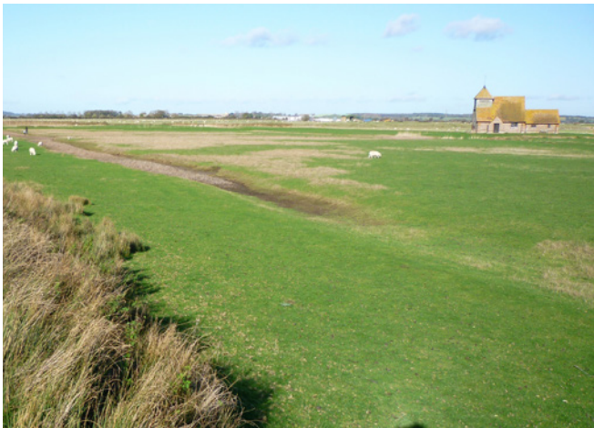
Figure 4 The late 13th century Fairfield Church lies just inland of the Great Wall protecting Walland Marsh; the Wall must pre-date the church.

With the dearth of direct evidence from excavation, a variety of proxy methods have been employed to elucidate the chronology of land-claim in England. These have shown that major drainage and flood prevention work was underway in several areas well before the Norman Conquest.