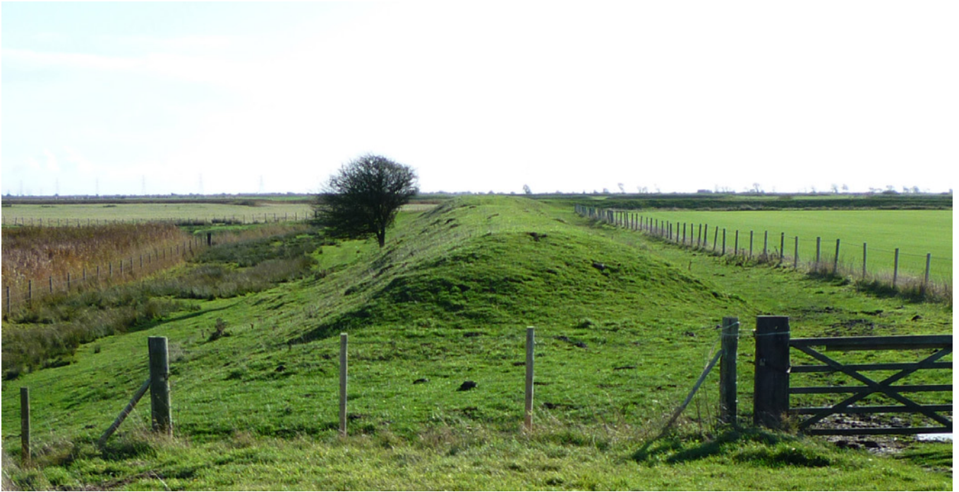
Figure 1 The 13th century 'Great Wall' on Walland Marsh.

In Britain, the history of marsh and fen reclamation is a subject little studied (except by historical geographers using documentary sources) before the mid-1980s. Even today, sea and fen banks are a poorly researched category of field monument, and in the absence of much excavation, archaeologists have had to use various strands of indirect evidence to elucidate the chronology of land-claim.