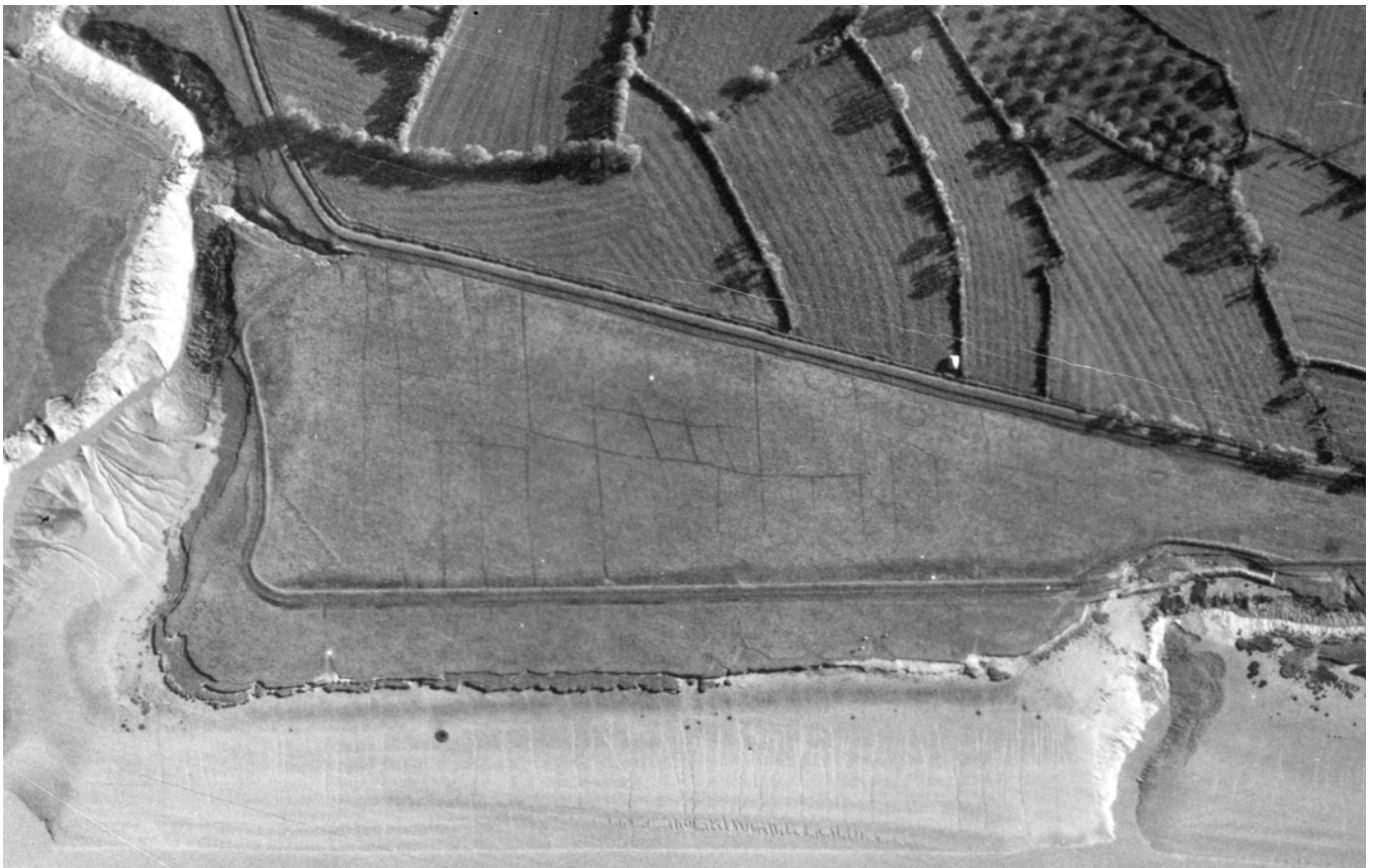
Figure 2 Detail from a 1946 vertical air photograph showing the reset seabank between Cowhill Pill and Oldbury Pill on Oldbury Flats, Severn estuary.

Often where new banks were built to seaward in order to reclaim additional land (termed 'progressive land-claim'), the original defences will survive abandoned and downgraded into simple field boundaries, ploughed over, quarried into or re-used as routeways; occasionally only a scarp separating areas of different elevation will remain (see Chronology , below). Conversely in areas affected by marine erosion, increased storminess or natural change in the course of rivers, defences will have been abandoned and realigned ('set back') further inland (Figure 2).