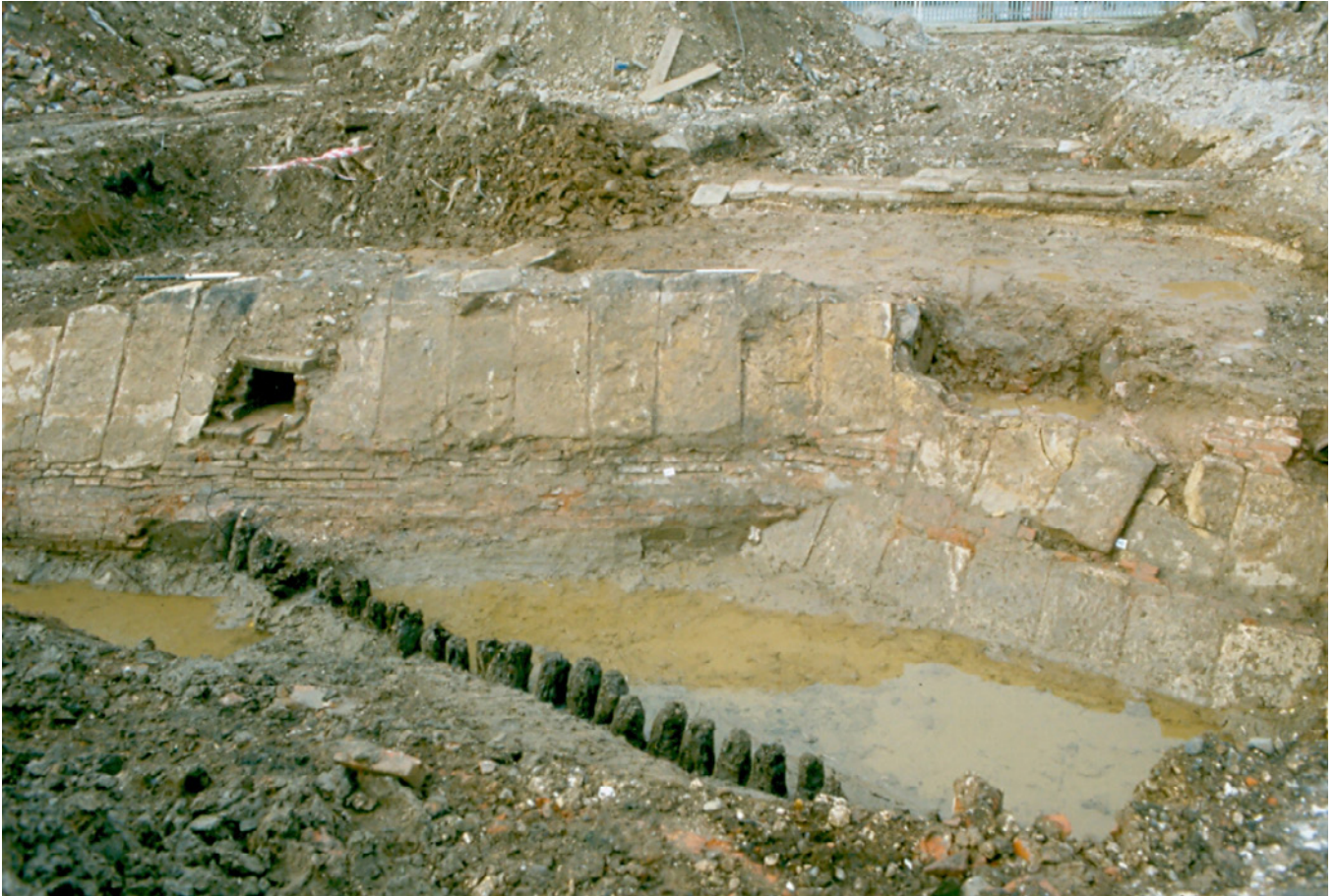
Figure 3 Faced flood embankments found in excavations at Hull Marina. The earlier (Henrician – that is, mid-16th century) seabank lies at an angle in the foreground, cut through by a 17th century successor behind.