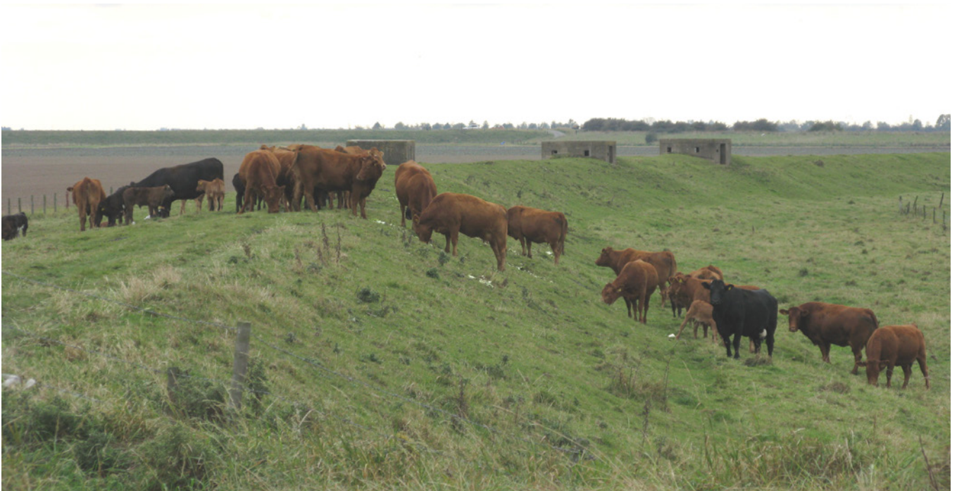
Figure 6 Seabank at Freiston, Lincolnshire, re-used as a stop line against German invasion in the Second World War

Around the Wash, seabanks were also frequently reused as anti-invasion lines during the Second World War, and are now crowned by pillboxes and other defensive structures (Figure 6). However, the antiquity of the seabanks in question is often unclear, and in many cases is probably post-medieval or modern.