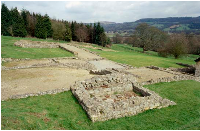
Fig. 5. Great Witcombe Roman villa, Gloucestershire. Visible remains of the North-West Range looking east.