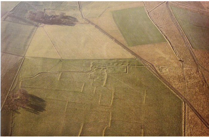
Fig. 3. Settlement, fields and trackway, Knook Down East, Wiltshire. A Romano-British village.