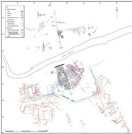
Fig. 7. Catterick Roman town, North Yorkshire. Plan showing all the evidence from remote sensing and excavations.