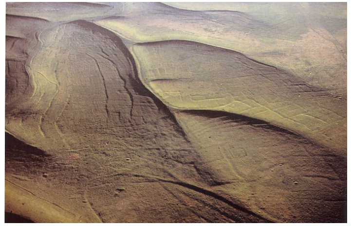
Fig. 4. Settlement, fields and trackway, Charlton Down, Wiltshire. A Romano-British village.

The nature of construction varies widely, reflecting function, status, and the availability of local building materials. Stone-founded buildings are fairly commonplace, and sometimes a timber superstructure, either timber-framed or post-built, may be assumed. Both urban and rural buildings (for instance, Frocester villa, in Gloucestershire, where this was suggested by massive foundations) could be of more than one storey. Typically locally-quarried stone and locally-manufactured tiles and other materials were employed in buildings; however, the higher the status of structures, or the degree of official involvement in the settlement or building, the more likely it is that expensive and imported materials would be employed.