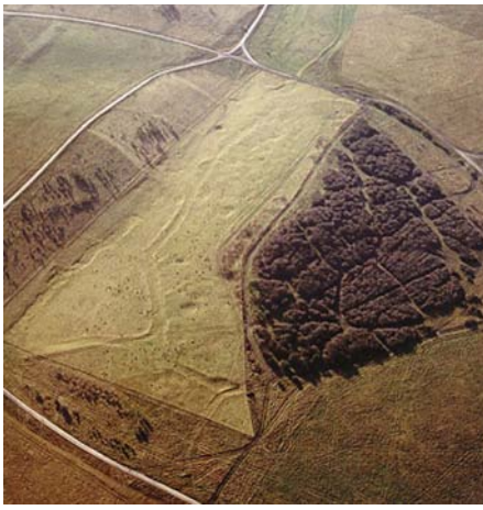
Fig. 1. Chisenbury Warren settlement and fields, Wiltshire. Romano-British village.