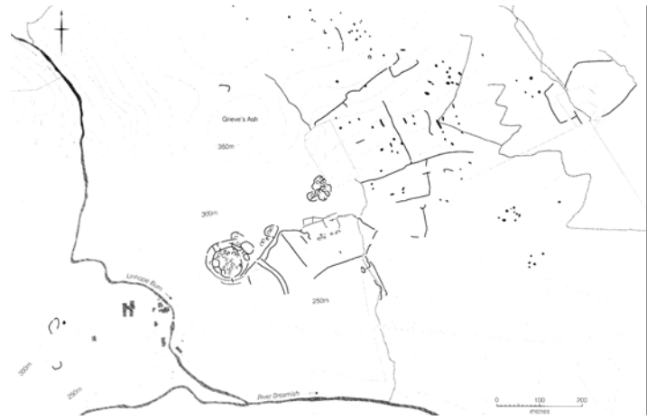
Fig. 2. Grieve's Ash settlement and fields, Northumberland. Late Iron Age and Romano-British settlements and fields.