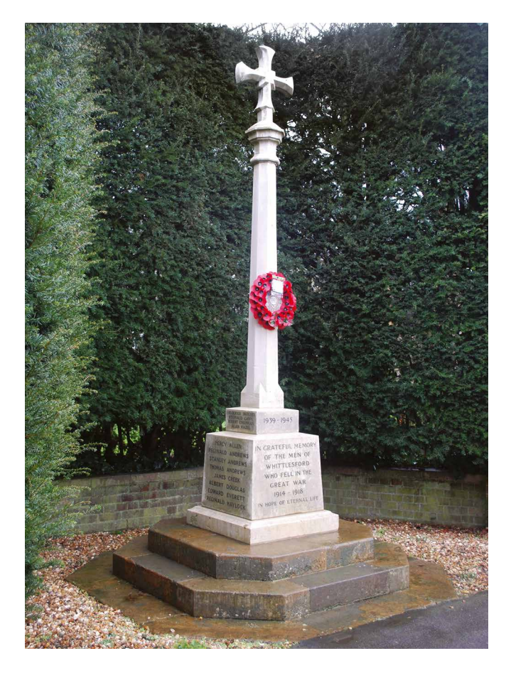
Figure 4 Whittlesford War Memorial Cross, Cambridgeshire. Listed Grade II.

Listing is not a preservation order. But it is intended to ensure that a structure's essential character and interest is maintained, and listed building consent via the planning system is needed for changes that might affect its special interest. In this way its long-term future is safeguarded.