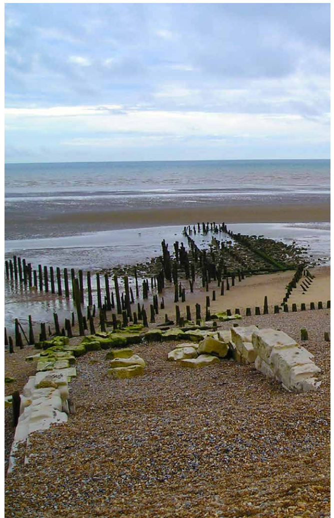
Figure 2 New Harbour, Rye, East Sussex.

It is important to note that failure to obtain the appropriate licence or breach of a condition held on a licence is an offence with a potential fine of up to a maximum of £50,000 in the Magistrate's Court or a fine and/or imprisonment of up to two years on indictment.