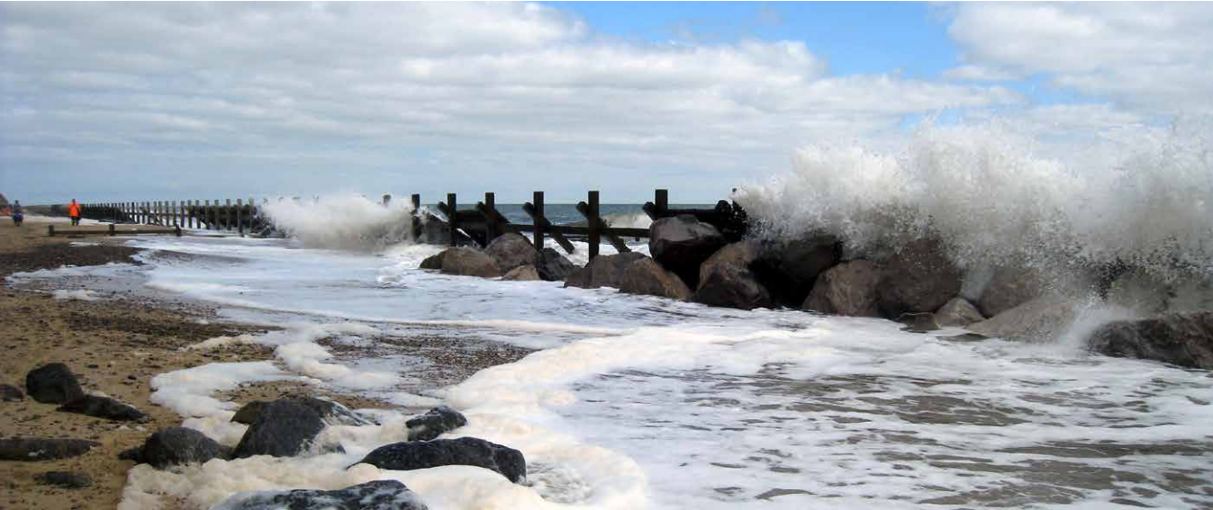
Figure 1 Happisburgh beach's failing sea defences.