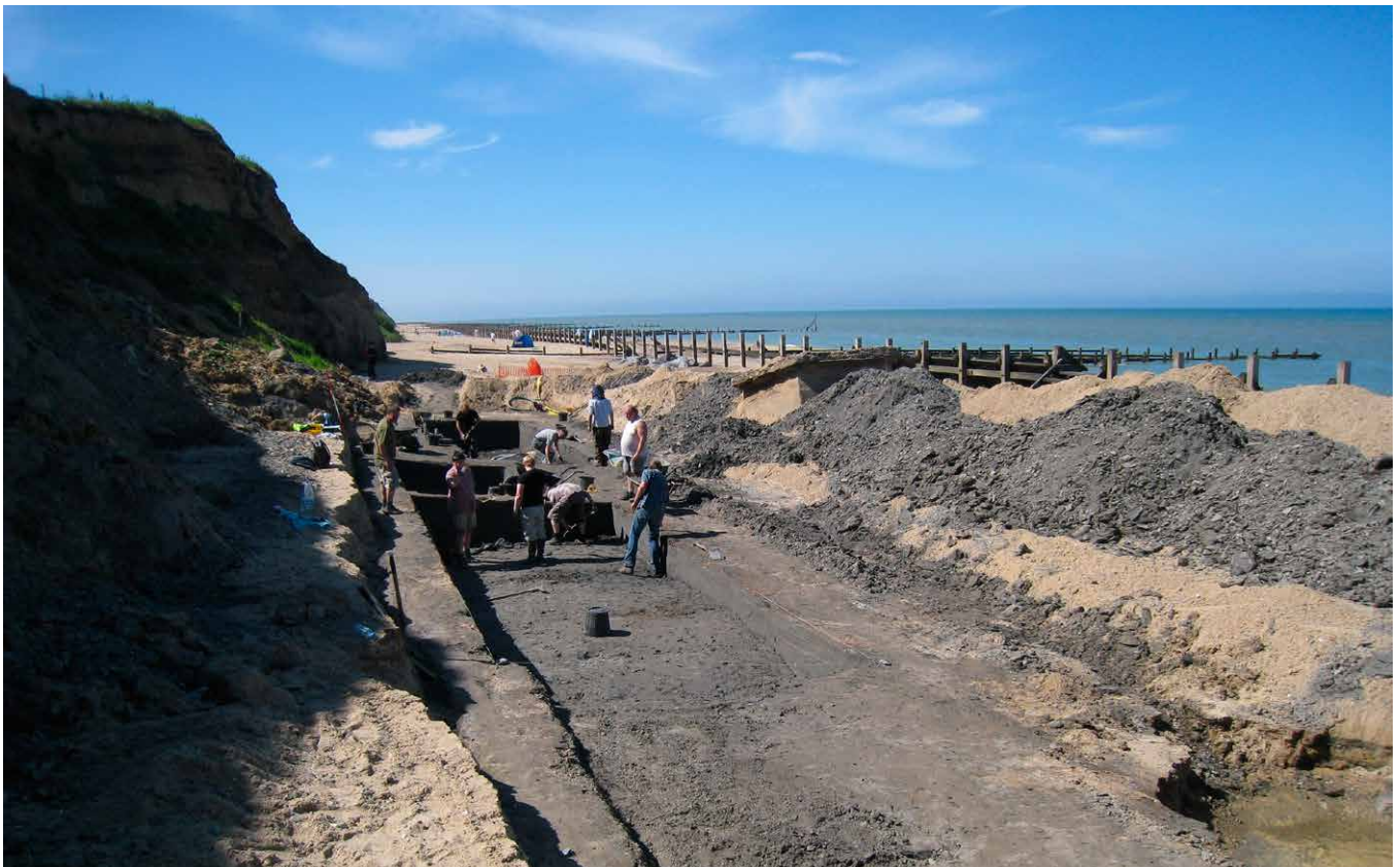
Figure 4 Excavation on the beach, Happisburgh, Norfolk.