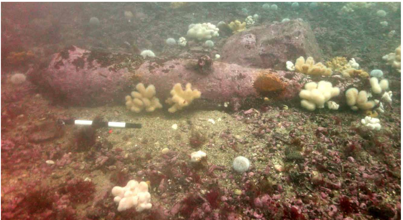
Figure 6 One of 19 17th- or 18th-century cast iron cannon, Gun Rocks, Farne Islands, Northumberland.

For more advice from regional Historic England offices please see overleaf.