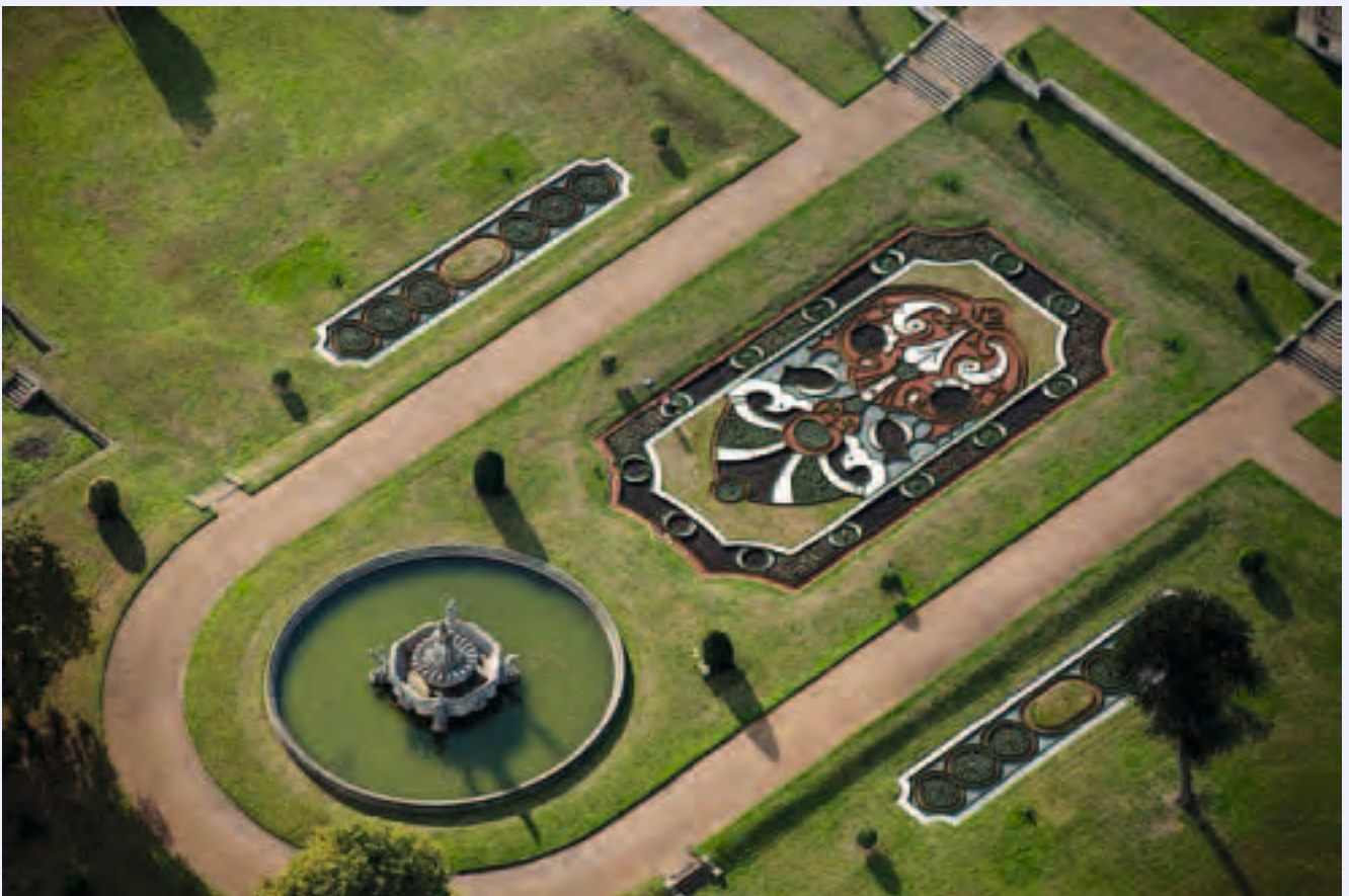
The East Parterre, Witley Court, Worcestershire, designed by William Andrews Nesfield, after restoration

Detailed research from investigations resulting from significant change is under way on several English Heritage properties (7A2), where redevelopment has required archaeological or architectural investigation in advance of works. The final academic monograph for Silbury Hill is with the publishers and the archive is being made available through the Archaeology Data Service (ADS). The book on the Kenilworth Castle