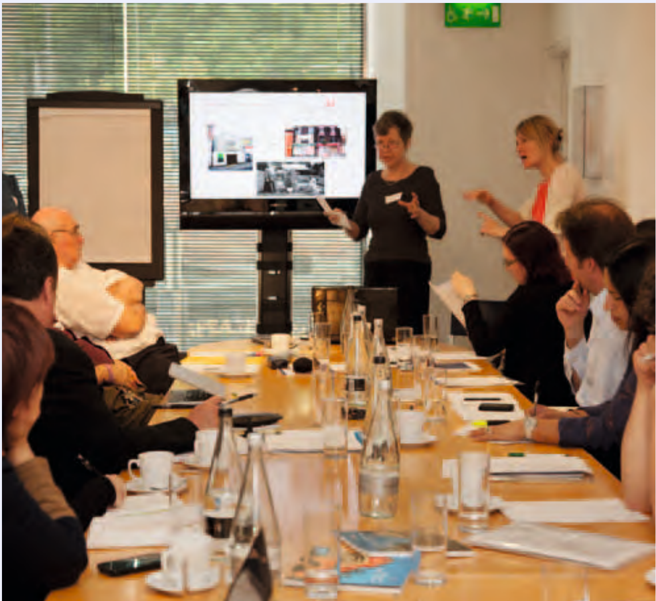
As part of the NHPP Equalities Impact Assessment, English Heritage commissioned a consultation with experts in under-represented heritage: one of seven seminars held to gather information.

We would welcome any views on the structure of this report to NHPP@english-heritage.org.uk