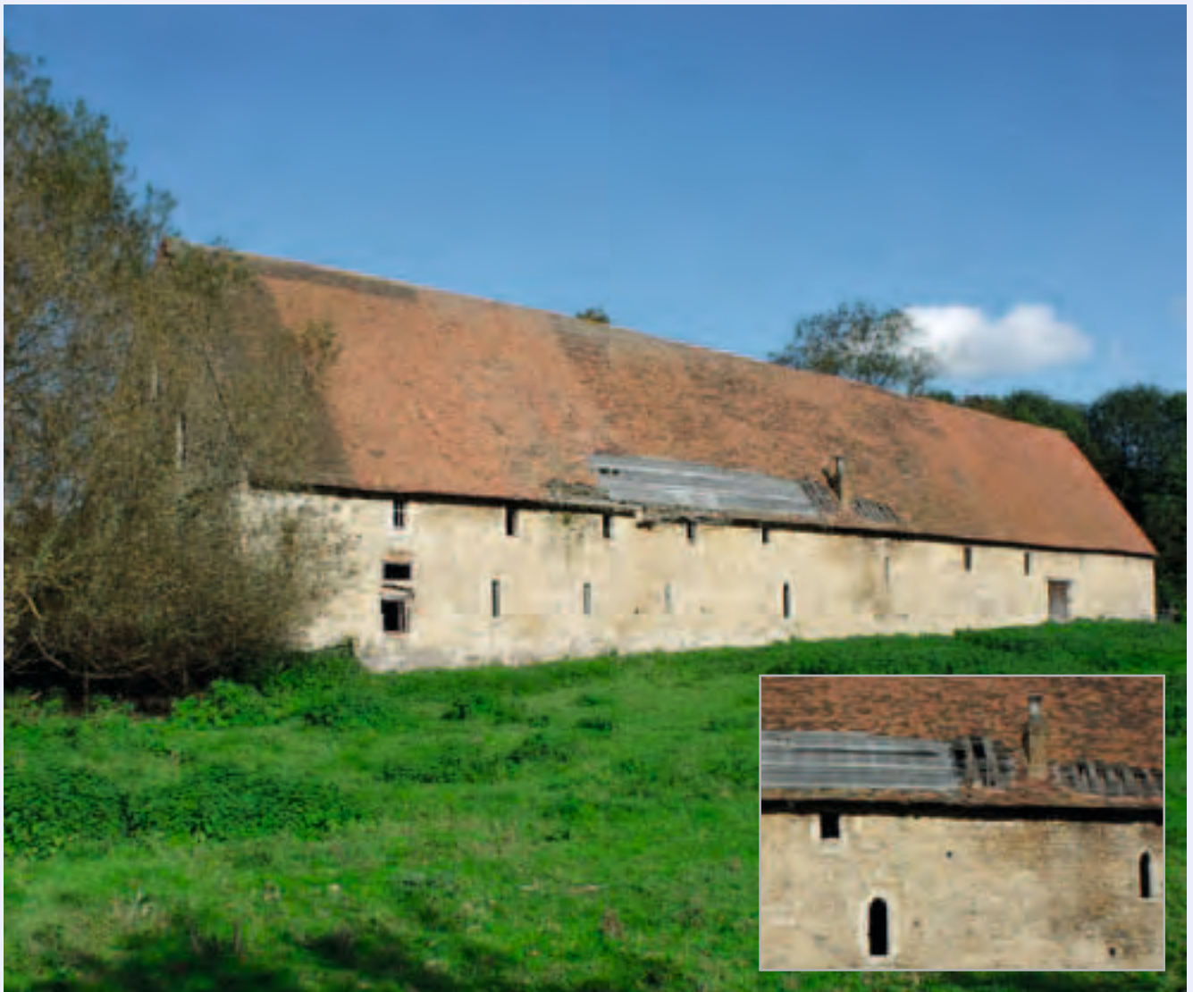
Boxley Abbey 'barn' in Kent (a scheduled ancient monument that was probably once the Abbey's hospitium). It was repaired in 2012 with financial input from English Heritage, English Nature and the Society for the Protection of Ancient Buildings. A low-key use is now planned by the owner.

Other issues affecting the historic environment and other activities carried out by the heritage sector are reported annually in Heritage Counts .