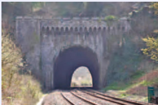
St Anne's Tunnel East Portal in Bristol, built 1836-40 to the designs of Isambard Kingdom Brunel, was upgraded to Grade II* in July 2012 as part of our Great Western Railway strategic project (5A1).

focusing on post-war private houses; transport and communications (4B3) with the signal box project underway, and a high-profile project to assess structures along the Great Western Railway in advance of a Network Rail electrification project; 20th century military heritage (4E2) with a number of Cold War cases in each territory under assessment as well as work on Defence Estates disposals; and places of worship (4D1), such as follow-through from the Taking Stock projects on buildings of Roman Catholic Dioceses. Our ongoing programme of Defined Area Surveys include Halifax town centre (undertaken at the request of the local planning authority), the London Borough of Newham, Sussex towns (including Midhurst), Wivenhoe in Essex, and public houses in Birmingham.