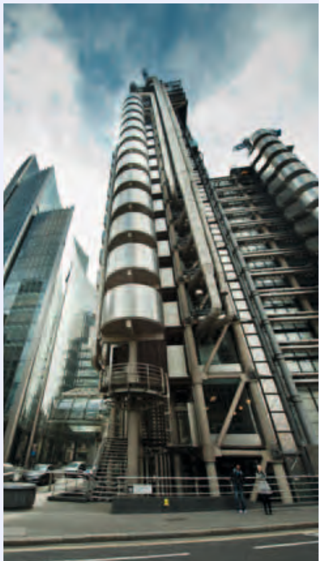
The Lloyd's Building, Lime Street, London, listed as Grade I in December 2011

Front cover: Widely regarded as one of the most remarkable single housing developments in the Grade II* listed Byker estate, Bolam Coyne fell upon hard times when the last resident moved out in 2000. Following investment from a multi-agency partnership, including English Heritage; Homes & Communities Agency, Newcastle City Council; and Your Homes Newcastle, it is again providing affordable homes for 15 families (8A3).