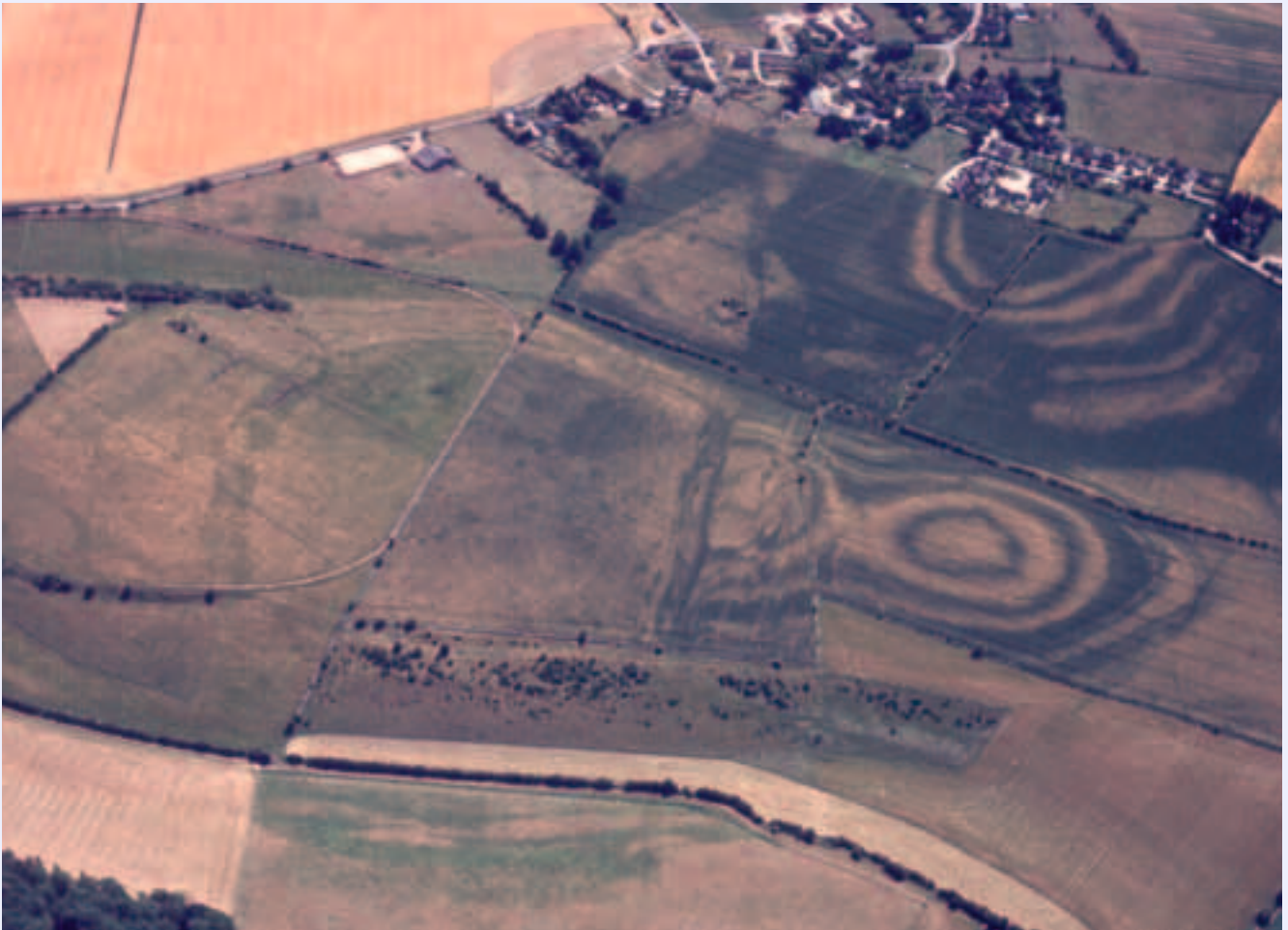
Condicote Henge - part of the North Gloucestershire Cotswolds NMP study area (3A4).

couple of months. Extensive urban surveys , Urban Archaeological Databases and metropolitan characterisation programmes are still progressing well (although still with some delays due to pressures in local authorities), with the Greater Manchester project now completed. Results show that significant archaeological sites and historic landscapes that reflect the history and character of the Greater Manchester area generally lack recognition and appropriate levels of protection. As part of our 20th-century architecture (4A2) programme, the report on England's schools 1962-1988 was completed and will be available shortly on the EH website; The 1970s in British Architecture , a series of articles on buildings of the 1970s was published in May 2012; as was Jubilee-ation ; a history of Royal Jubilees in public parks; and work has started on the 3rd edition of England: A guide to post-war listed buildings . A survey commissioned to assess the threats to, and the significance of our key historic ports (4A3) is almost complete. Two new projects have also started: the first a rapid assessment of the history and heritage