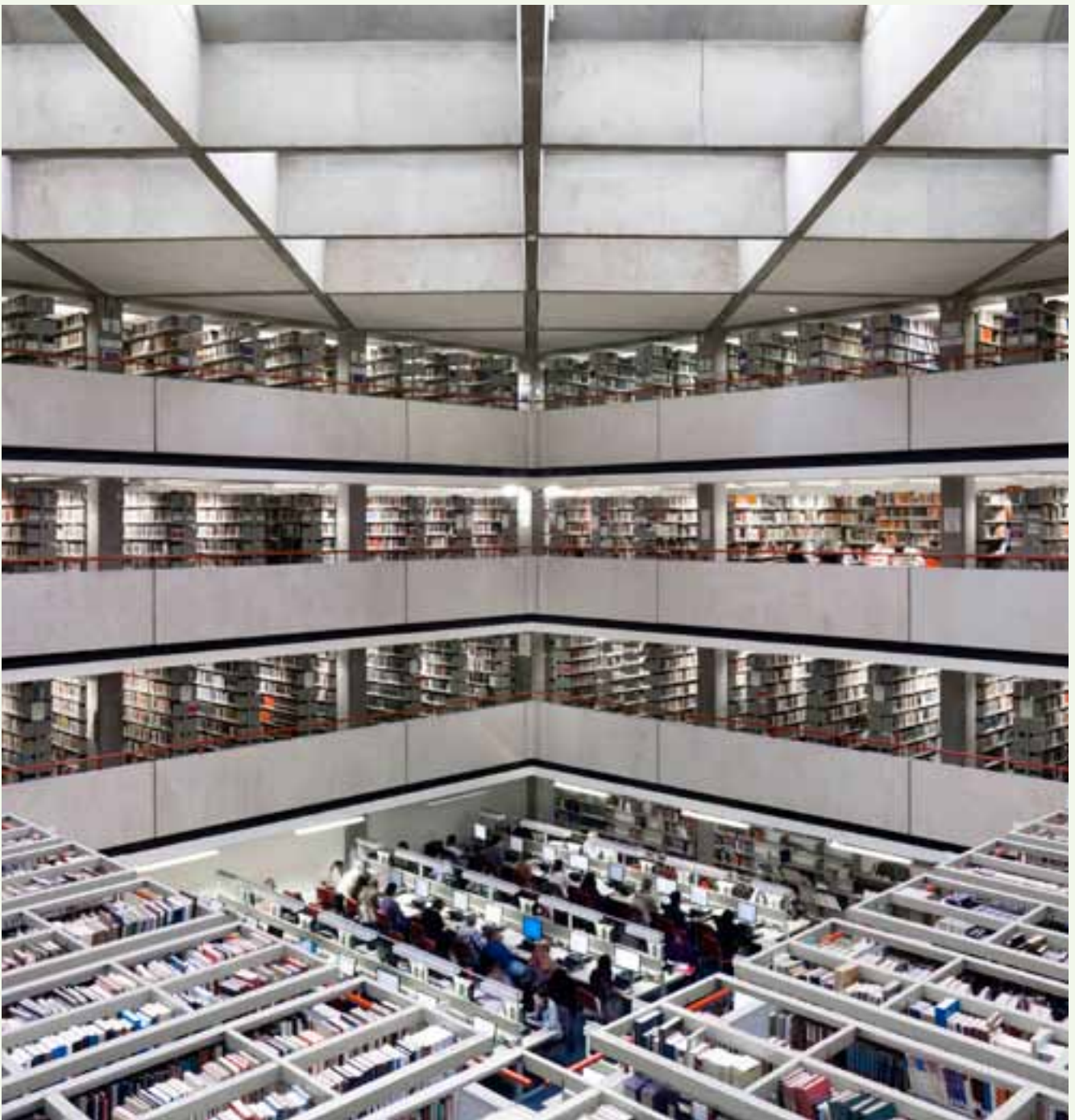
The Philips Building at the School of Oriental and African Studies, listed at Grade II* in May 2011 (5A1).

We would welcome any views on the structure of the report to NHPP@english-heritage.org.uk