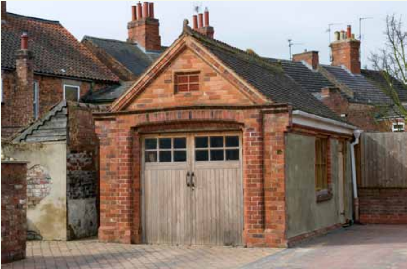
Motor house to rear of property on Priory Road, Spalding, Lincolnshire (4B3).

of, our key national historic ports (4A3), and to review the impacts of the Sea Change programme, in order to develop a management strategy. EH and HLF are collaborating on a national assessment of threats to municipal buildings (4A4) and the report is due out shortly. A partnership project by Norfolk Building Recording Group, the University of East Anglia and EH is surveying the significance of rural Norfolk schools. A project on historic libraries has been delayed by EH restructuring.