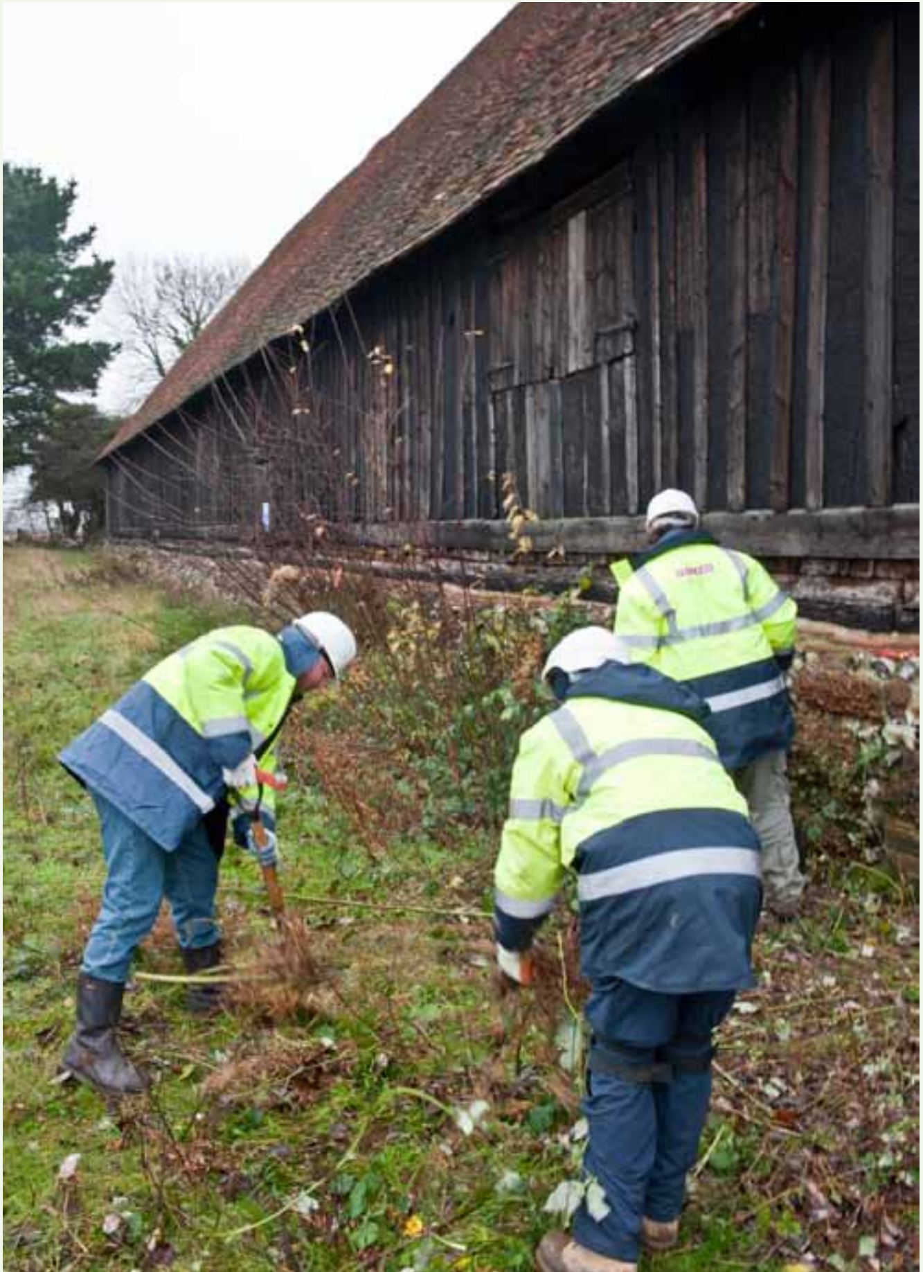
Clearing the undergrowth, Harmondsworth Tithe Barn, Hillingdon, Middlesex (8A4).