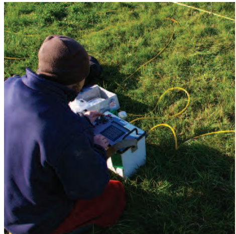
Figure 13 Chris Carey employing the IRIS Syscal Electrical Resistivity Ground Imaging (ERGI) system to investigate subsurface stratigraphy at Lockington, Leicestershire, as part of the English Heritage ALSFfunded Trent-Soar project (PNUM 3357).