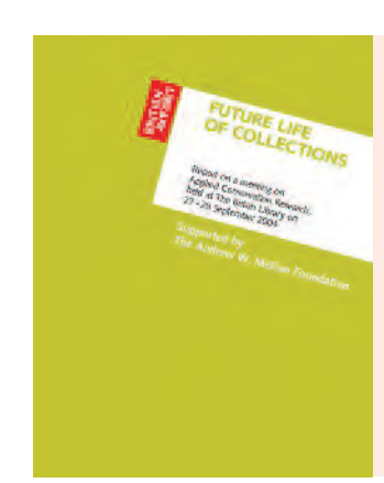
Figure 22 Cover image of the Future Life of Collections, a summary of a meeting funded by the Andrew W Mellon Foundation to discuss the development of a strategy for applied conservation research into paper-based library and archive materials.

Initiatives such as Future Life of Collections which identified and prioritised research for the libraries and archives sector are important developments, and have yielded useful results that have tackled some of the most critical issues. Similar programmes are needed for other sub-sectors. AHRC / EPSRC research clusters (such as EGOR) have provided settings in which to direct research agenda in the absence of more formulated structures.