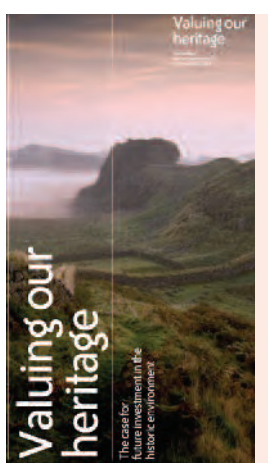
Figure 23 Cover image of Valuing our heritage – The case for future investment in the historic environment, which looks at the public benefits of heritage. The report was produced by Heritage Link, English Heritage, the National Trust, the Historic Houses Association and the Heritage Lottery Fund.

■ The sector could get better at communicating effectively the contribution it can make to such issues and interests, demonstrating the value of the funding invested in both practice and research.