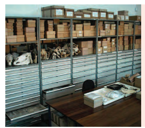
Figure 21 The English Heritage vertebrate skeleton reference collection at Fort Cumberland.