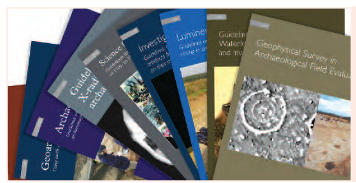
Figure 18 A number of recently produced English Heritage scientific guidance documents.