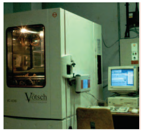
Figure 17 Modelling the corrosion of iron infested with chloride salts within a climatic chamber at Cardiff University. This study to improve the understanding of the behaviour of heritage materials underpinned the conservation plan for the ss Great Britain.

The other area where additional research is suggested is in relation to NHSS theme 4 where recommendations are given for the need to enhance existing techniques and develop new tools and techniques.