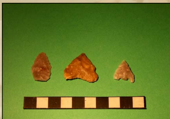
Neolithic and Early Bronze Age flint arrowheads discovered during fieldwalking over the site of a proposed gravel quarry in the Milfield Plain.

During the Till-Tweed project over 2,700 stone tools and chips were found allowing the locations of Mesolithic, Neolithic and Early Bronze Age settlements to be identified. The stone tool distribution has also allowed areas of landscape to be characterised according to the different types of activities that took place there and the different periods to which they relate. For example Neolithic sites have been identified at New Bewick and Akeld in the Till valley while Mesolithic sites have been identified at St Cuthbert's Farm and Norham village next to the Tweed.