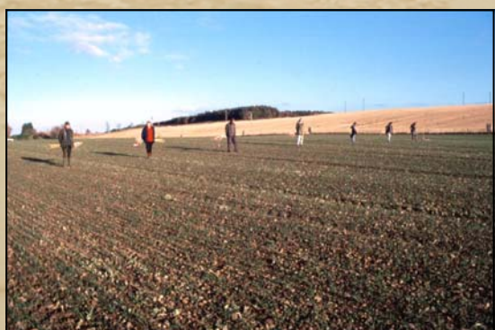
Systematic fieldwalking can identify the location of sites unlikely to be identified through aerial photography or geophysical survey.

During the Till-Tweed project over 2,700 stone tools and chips were found allowing the locations of Mesolithic, Neolithic and Early Bronze Age settlements to be identified. The stone tool distribution has also allowed areas of landscape to be characterised according to the different types of activities that took place there and the different periods to which they relate. For example Neolithic sites have been identified at New Bewick and Akeld in the Till valley while Mesolithic sites have been identified at St Cuthbert's Farm and Norham village next to the Tweed.