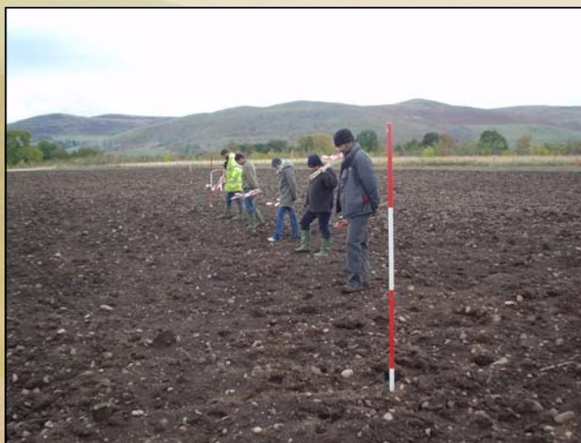
Fieldwalking at Akeld near Milfield. Walking at intervals of 2m maximises artefact recovery and accuracy of site location.

The most common finds are stone tools and pottery. Therefore, it is particularly useful for identifying Stone Age (Mesolithic, Neolithic) and Early Bronze Age sites, as well as Roman, high medieval and post-medieval sites that sometimes produce large quantities of well-fired pottery. Where sites are identified by aerial photography or geophysics, fieldwalking can be used to assess their date.