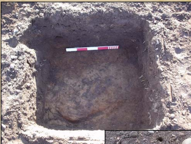
A test-pit from Akeld which revealed a pit below the cache of flints found on the surface.

Test-pits can vary in size from 1m and 2m squares to 5m squares. They are usually excavated in a grid pattern and the contents of each pit are sieved to maximise finds recovery. Test-pitting was successfully used during the Till-Tweed project to test whether artefact scatters identified during fieldwalking had buried remains surviving below them. At a site near Akeld a pit feature was discovered below a cache of Neolithic blade tools indicating the presence of preserved deposits below the ploughzone.