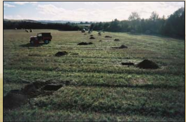
Test-pitting being used to examine an area that produced a large quantity of Mesolithic flints as a result of field-walking and resulting in the identification of buried features.

Test-pitting is often used in conjunction with other forms of archaeological investigation to test for the presence of sub-surface archaeology. In areas where it is not possible to fieldwalk, such as fields under permanent pasture, regularly spaced test-pits allow the ploughsoil to be sampled for the presence/absence of artefacts, while also allowing for the identification of buried deposits. Test-pitting is different to evaluation trenches as test-pits are usually hand dug, and much smaller, with the entire contents of each pit usually being passed through a sieve.