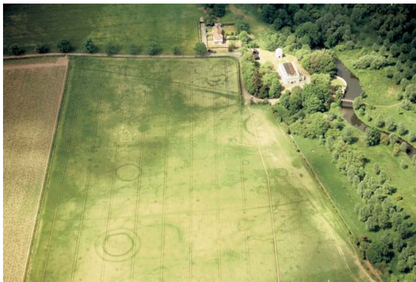
Cropmarks of the barrow cemetery at Langham in the Stour Valley.

As well as a number of Mesolithic and Neolithic occupation sites (see Garrow 2006 for summaries), a full picture of Bronze Age river valley/floodplain land-use in Cambridgeshire is emerging from the Barleycroft Farm and Over Quarry fieldwork, which extended across both banks of the lower reaches of the River Great Ouse. Not only has this included the excavation of field systems, open and enclosed settlements, but also of ring-ditches (one with a cemetery of 35 cremations) and barrows (Evans and Knight 2000 and 2001; see also Bradley 2007, fig. 4.7 and Yates 2007, 95–6, fig. 10.6). Included in the barrow groups are two new pond barrows, previously unknown from the area, in association with unditched, turf-built barrows containing multiple cremations in