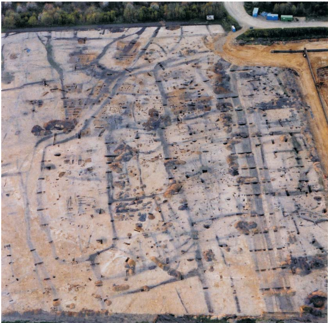
Excavation in progress at Camp Ground, Cambridgeshire.

dating evidence, the potential for investigating the relationships between these and other types of site, etc. — are equally applicable for the Roman period. At Hopton-on-Sea, where an extremely dense and complex cropmark landscape has been mapped, there is some evidence for a reorganisation of land division during the Roman period. The new field layout followed the same alignment as a probable Roman road, and although the road may pre-date the establishment of Burgh Castle shore fort only a few kilometres away, the reorganisation of the fields along the line of the road may be influenced by this later military presence. The testing of this postulated chronology would be an extremely fertile area for future research, with the potential to investigate questions about the ‘planning’ of such field systems, to what extent they ‘replaced’ earlier boundaries and alignments, and the influence of the military within this part of the region. Equally, the coaxial, track-defined field systems identified on the Broads interfluves (described in the ‘Iron Age’ chapter), for which there is some evidence of a Roman date for their use or even their establishment, also offer the opportunity to look at wider questions of social structure and its impact on the landscape. In particular, a number of villas or high-status sites have been identified on the edges of the Broads field systems, and the