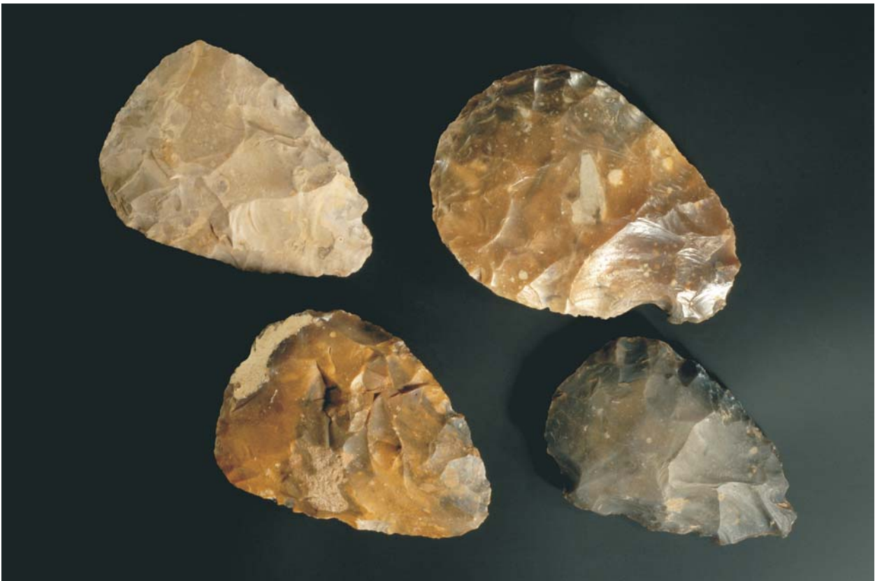
Mesolithic handaxes from the North Sea.

As noted for the coastal environment generally, further chronological work is needed to develop a longer and more detailed sea-level curve for the southern North Sea.