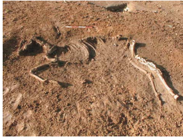
Horse burial at Marsh Leys Farmstead, Bedfordshire. Religious practice or natural death?

A number of Roman rural cemeteries have been excavated; examples include those at Stansted Airport and