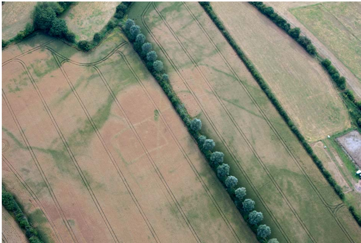
The long mortuary enclosure at Feering, Essex.

generally interpreted as the remains of plough-levelled long barrows, oval barrows or mortuary enclosures, have been mapped (Albone et al. 2007a; 2007b; 2008; Hegarty and Newsome 2005; Hegarty 2006). In most cases such sites are undated, other than on morphological grounds, and their character — whether they possessed a mound or internal bank, or even whether they were funerary in nature — requires further investigation.