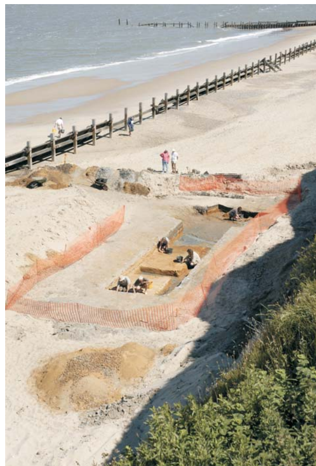
Excavations at Happisburgh.

The Happisburgh project, Norfolk, was set up after flint artefacts (including a handaxe) and butchered bone were discovered in the organic muds that underlie the rapidly eroding coastal cliffs. In 2004 Happisburgh I was excavated, revealing flint tools, bone, wood and other plant materials, which lay at the marshy edges of a large river. The discovery of the extinct water vole ( Arvicola cantiana ) suggests that this site dates to between 500,000 and 600,000 years ago. Two further sites were discovered, Happisburgh II and III. At the latter a gravel river channel also revealed flint tools, bone and plant materials, this has been dated to at least 700,000 years BP. If it is older than this date, then it would be the earliest human site in northern Europe. The evidence from Happisburgh III has huge implications for our understanding of the earliest colonization of Europe and the types of environment in which early humans could survive.