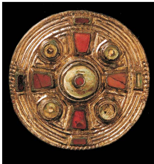
Keystone garnet disc brooch from a grave at Bloodmoor Hill, Suffolk.

A middle Anglo-Saxon cemetery has been identified at Ely Cathedral (Cessford and Dickens forthcoming), and a middle Anglo-Saxon execution cemetery in Cambridge (Cessford et al. 2007). There are groups of 7th-century burials (with high-status females in each) at King's Garden Hostel, Cambridge and at Westfield Farm, Ely. The latter had a central grave probably under a small mound containing a bone comb and two complete blue glass palm cups.