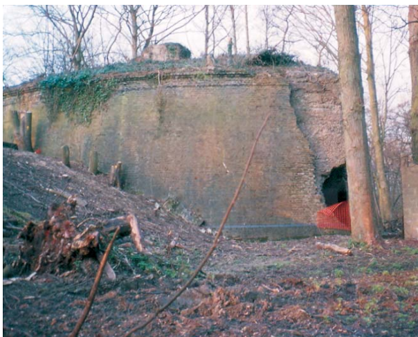
Nitro-glycerine mixing-house at Waltham Abbey gunpowder factory.

Ongoing survey of post-medieval flint mines in north-west Suffolk and south-west Norfolk includes the examination of aerial photographs, which demonstrates three types of mining in the late 18th to 20th centuries. Aspects of the chalk extraction and lime production industry have also been highlighted by excavations in Norwich and Bury St Edmunds.