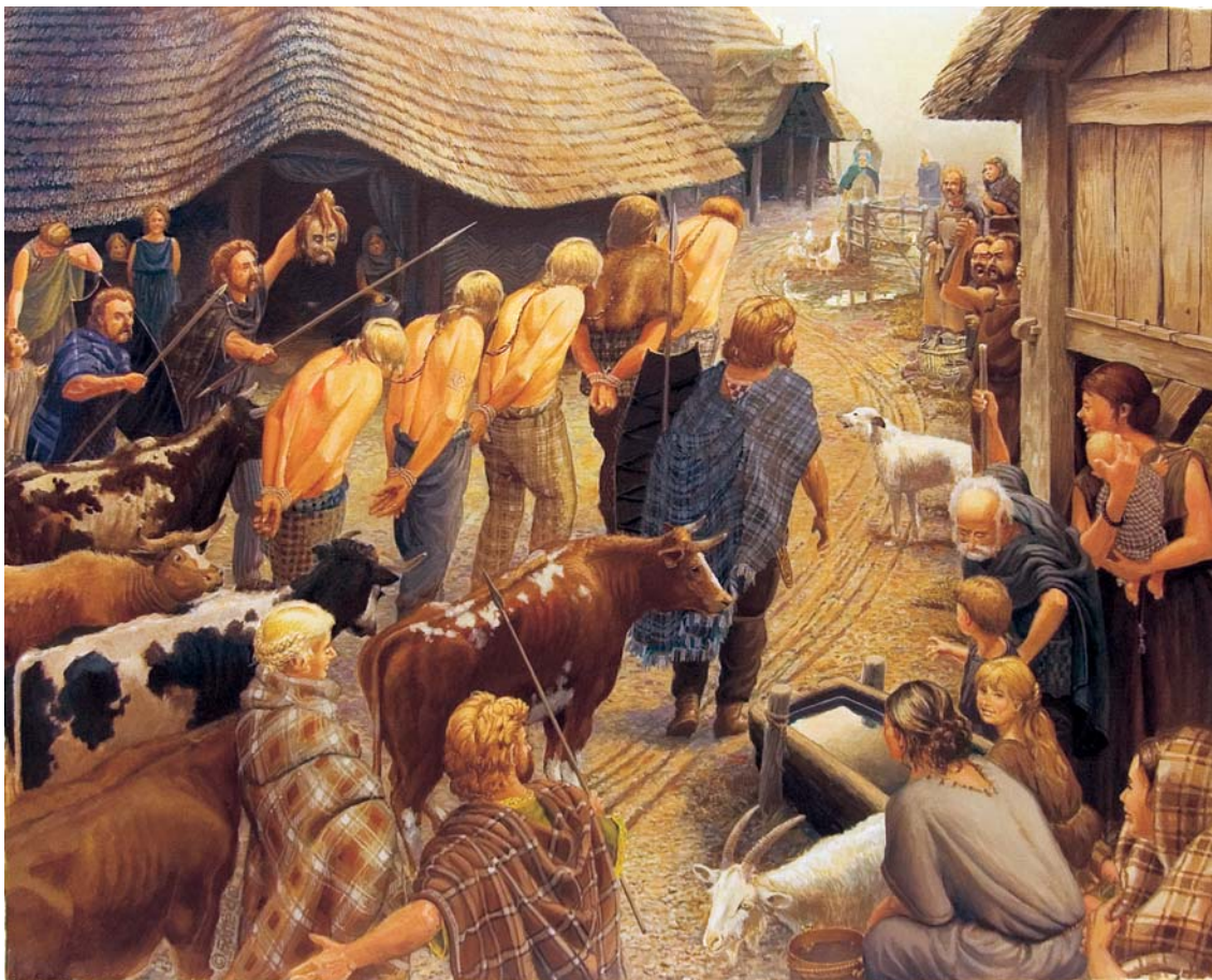
Slaves and cattle being paraded through an Iron Age village in Essex after a raid by warriors.