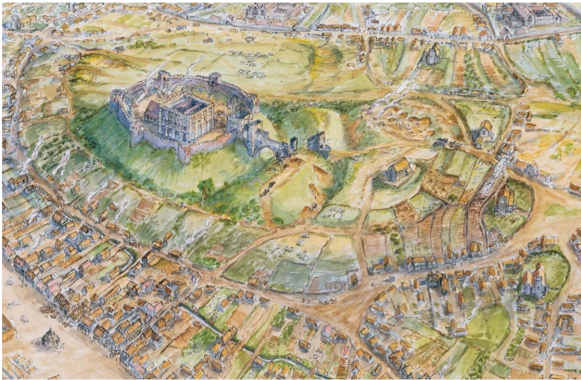
Norwich Castle c.1700, showing the infilling of the Castle ditches. Reconstruction drawing by Nick Arber, copyright Norfolk Museums and Archaeology Service

production needs research. Work is currently underway to address these issues in Cambridge particularly with regard to the Grand Arcade site but also involving material from other excavations. Late medieval and post-medieval small metal artefacts (buckles, buttons, mounts etc. ) are very similar all over the country. It would be interesting to know whether these objects are copied widely but produced locally, or if they are being produced in a limited number of places and distributed widely. The long history of finds recording in the East of England has produced an unparalleled dataset which could be used to explore this research topic.