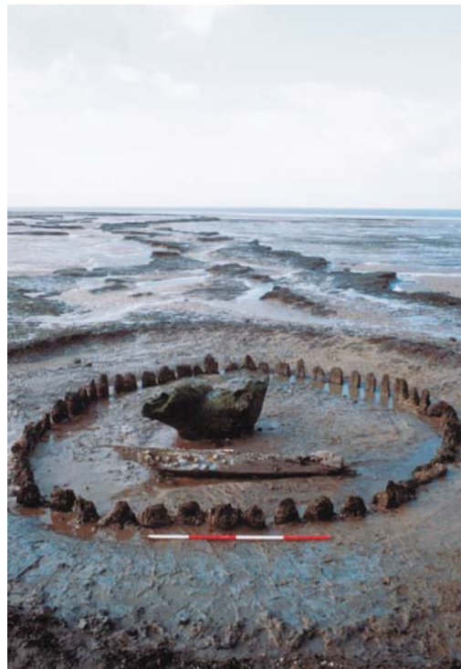
Seahenge, on the north coast of Norfolk

Two enclosures possibly associated with prehistoric settlement were identified by the Norfolk NMP at Rackheath, to the north of Norwich (Albone et al. 2008). One appears to represent a circular ringwork enclosure, with possible internal roundhouse, which compares well with North Ring, Mucking. (There are also, however, strong similarities between this site and the early Iron Age