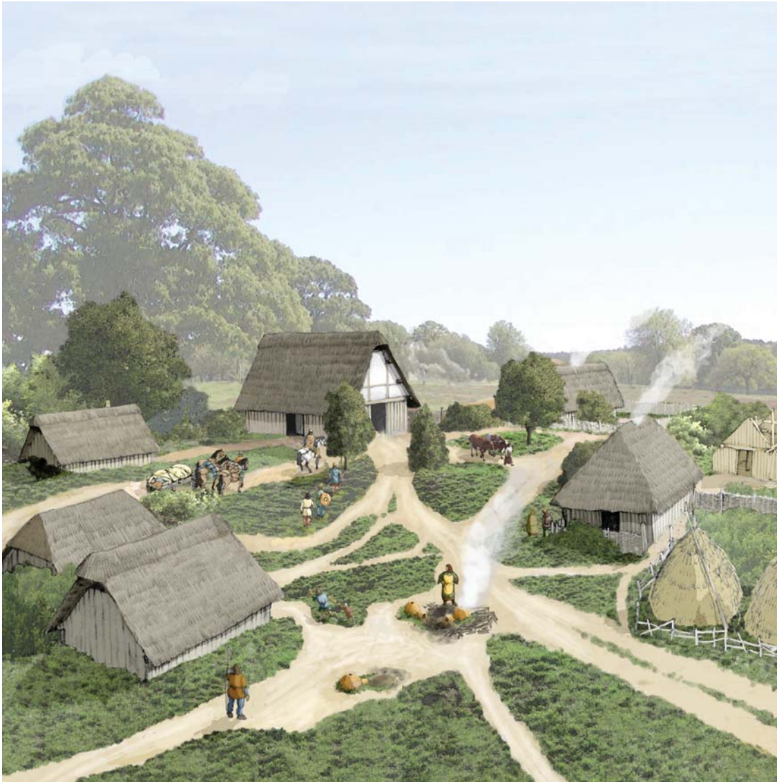
Early Saxon village at Brandon Road, Thetford. Reconstruction drawing by Jon Cane, copyright OA East