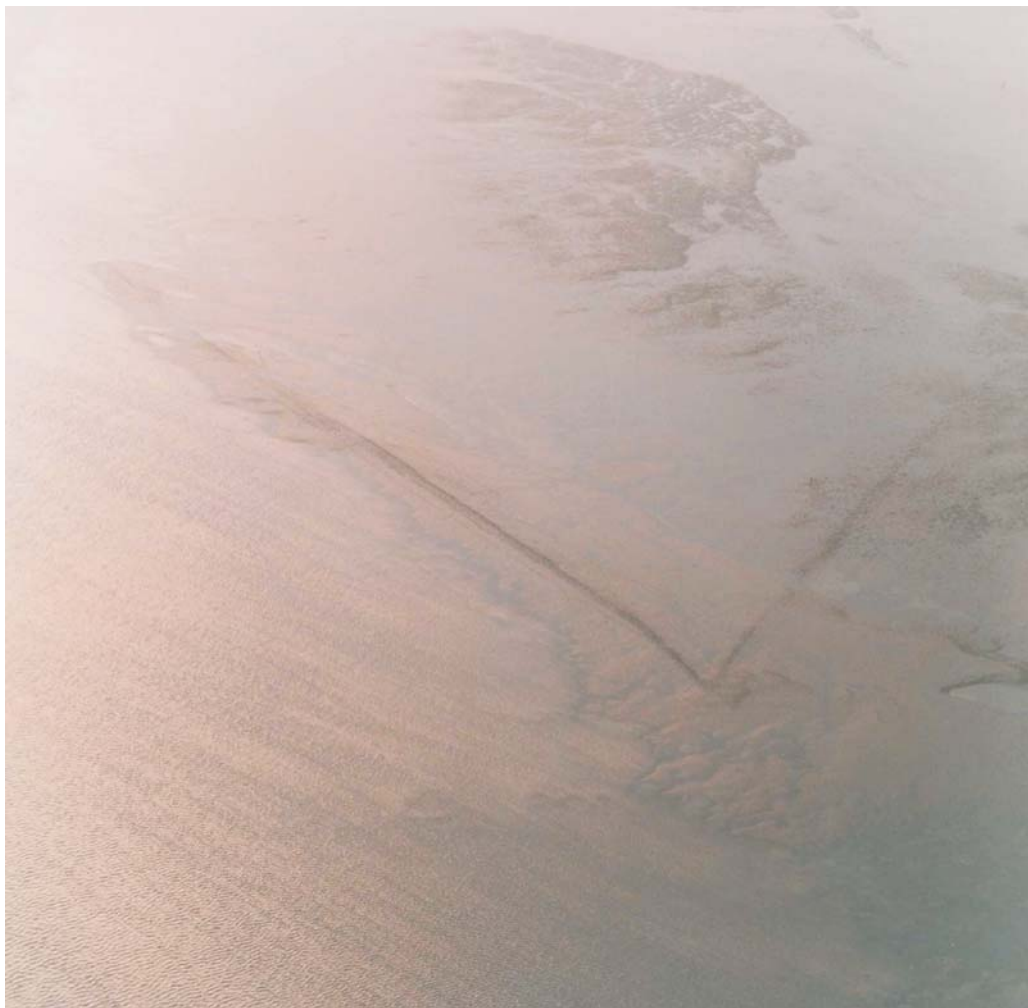
Anglo-Saxon fish-trap visible in the river Stour at Holbrook

storage), changes in use ( e.g. former industrial sites becoming Nature Reserves), dredging, drainage and power creation (nuclear power stations and wind farms). Joint working practices should be developed with government organisations ( e.g. the Environment Agency, Port of London) and non-government organisations ( e.g. the RSPB and Wildlife Trusts), in order to ensure a fully integrated approach to the historic environment.