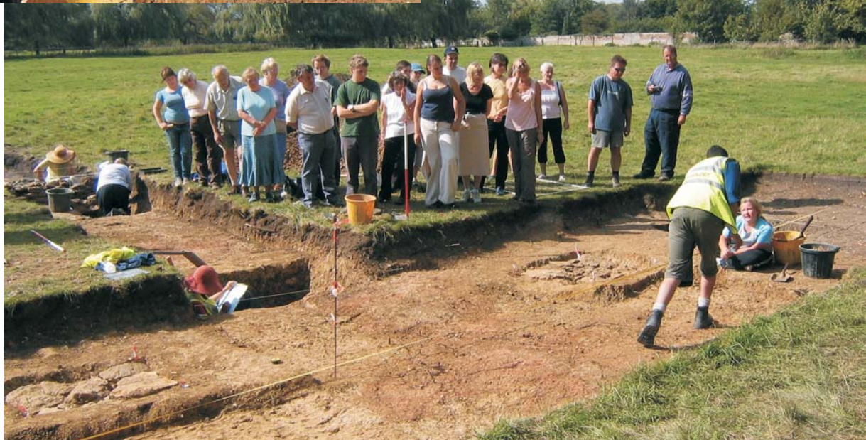
Thorney community excavations, Cambridgeshire.