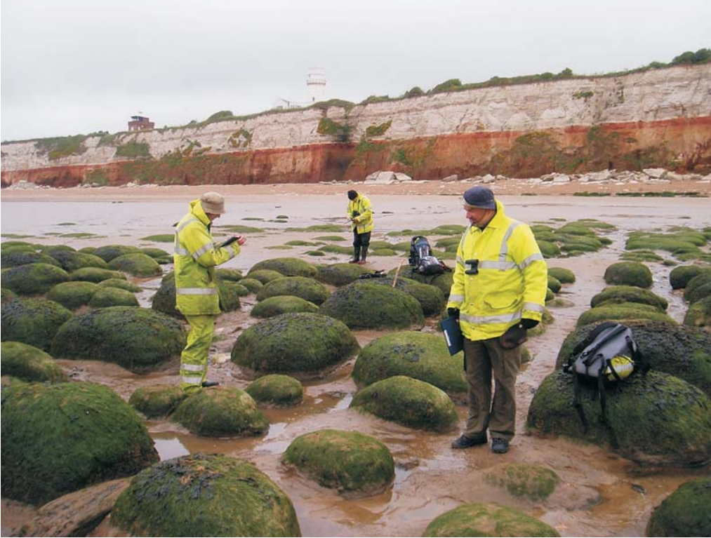
Frontispiece: the Norfolk Rapid Coastal Zone Assessment Survey team recording timbers and ballast from the wreck of The Sheraton on Hunstanton beach, with Hunstanton cliffs and lighthouse in the background.