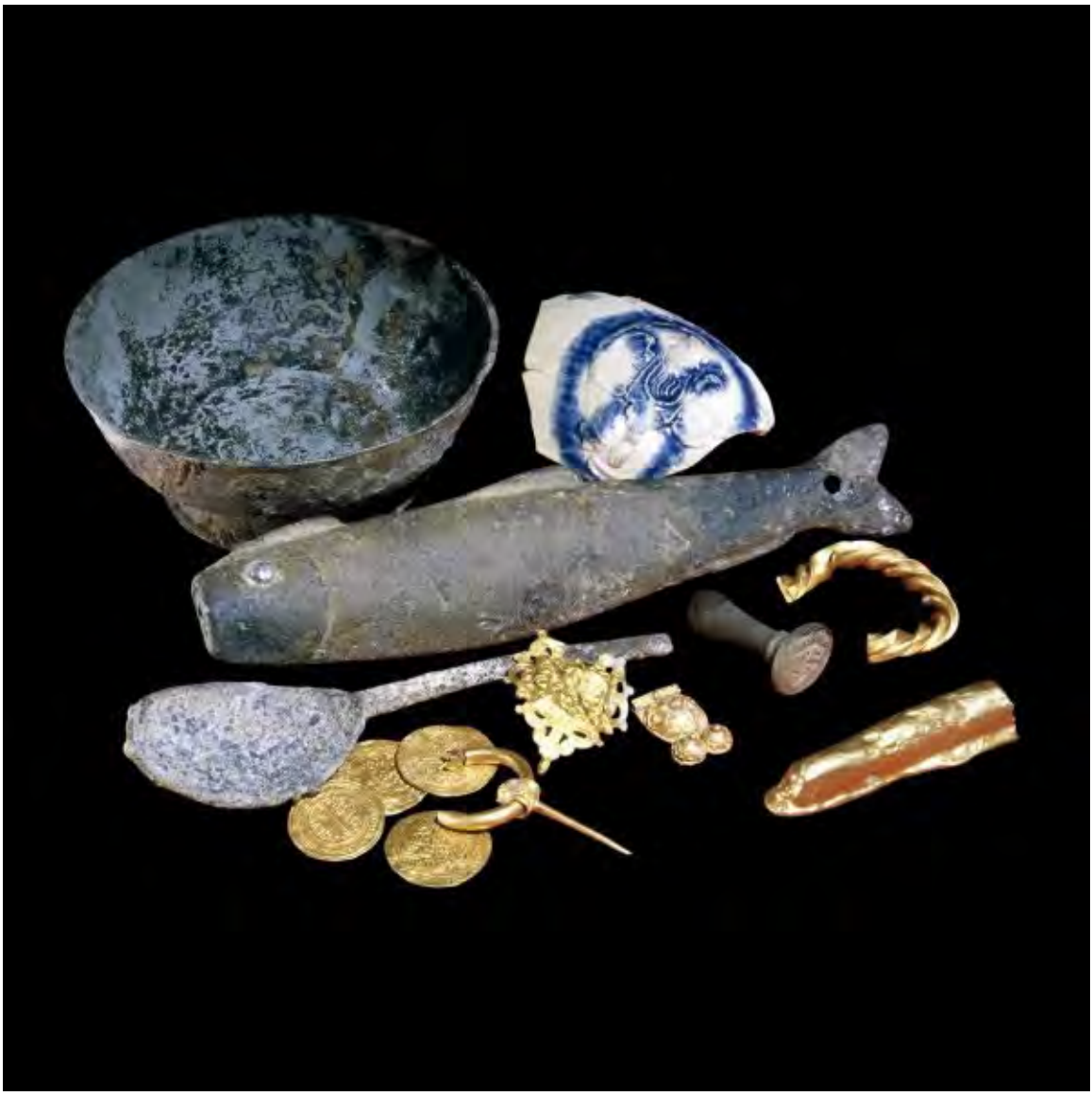
A selection of finds from the Salcombe Cannon Site

Prepared for Historic England January 2018