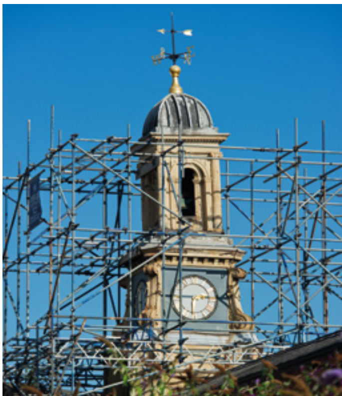
Green Lane Works, Sheffield