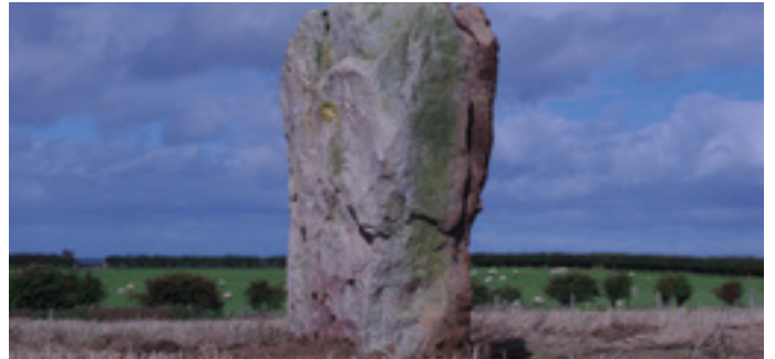
Wade's Stone

The Moors and Wolds has archaeology as rich, if not richer than at Stonehenge. There are hundreds of ancient monuments that tell us all about our past but many of them are at risk through farming or bracken growth. We have been working with the North York Moors National Park Authority to find solutions using the latest technology. We've also looked for opportunities, like attending Driffield Show, to let people see how they can play a part in looking after these monuments.