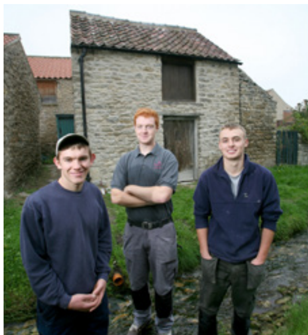
TECAP apprentices, Helmsley

e: deborah.wall@english-heritage.org.uk t: 01904 601 990