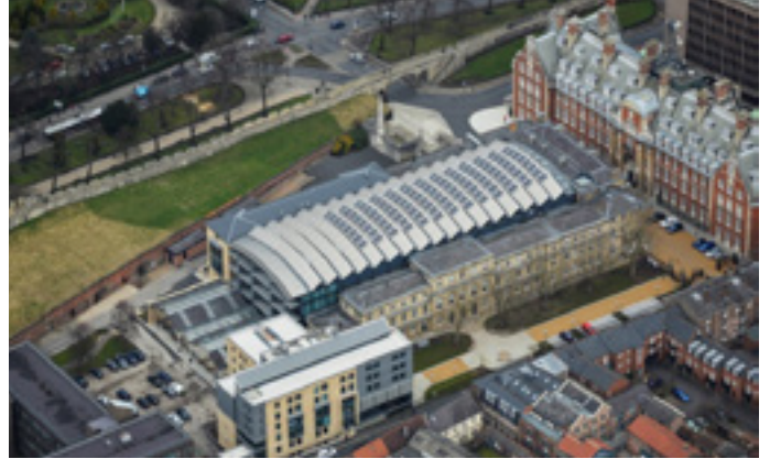
West Offices, York

One of our highlights last year was seeing City of York Council move into their iconic new headquarters and customer service centre right across from our own offices in Tanner Row. The development celebrates the valuable heritage elements of York's original railway station from 1840, Grade II* listed, and incorporates it sensitively with new design to create a place that serves the people of the City once again.