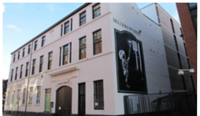
Sellers Wheel, Sheffield

Sellers Wheel is a stunning example of constructive conservation work that we're really proud of. This Grade II listed 19th-century courtyard complex originally housed John Sellers and Sons - manufacturers of pen knives, table cutlery and razors. Original features like vaulted ceilings, fireplaces and beams are incorporated in the mixed-use development with a popular coffee house, office space and student flats. After a period of uncertainty, the building once again has a buzz about it and contributes positively to the feel of the surrounding Cultural Industries Quarter of Sheffield.