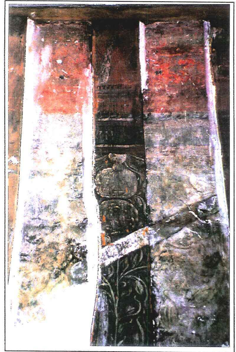
Detail, imitation brocade tapestry painted directly on stud and plaster wall