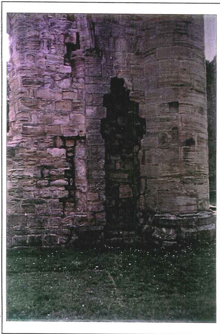
Chancel, south side, western arch of blocked arcade